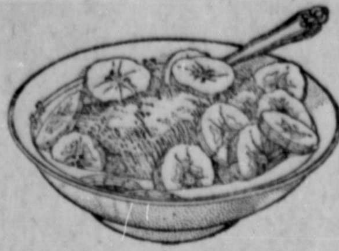
Made in Canada.

Strength in Summer comes to the man or woman whose daily diet consists of cereals and fruits. Meat and potatoes are a heavy load on the digestive organs. The ideal Summer diet is Shredded Wheat Biscuit , a food that is 100 per cent. whole wheat and prepared in a digestible form. For breakfast with sliced bananas or berries, with milk or cream.