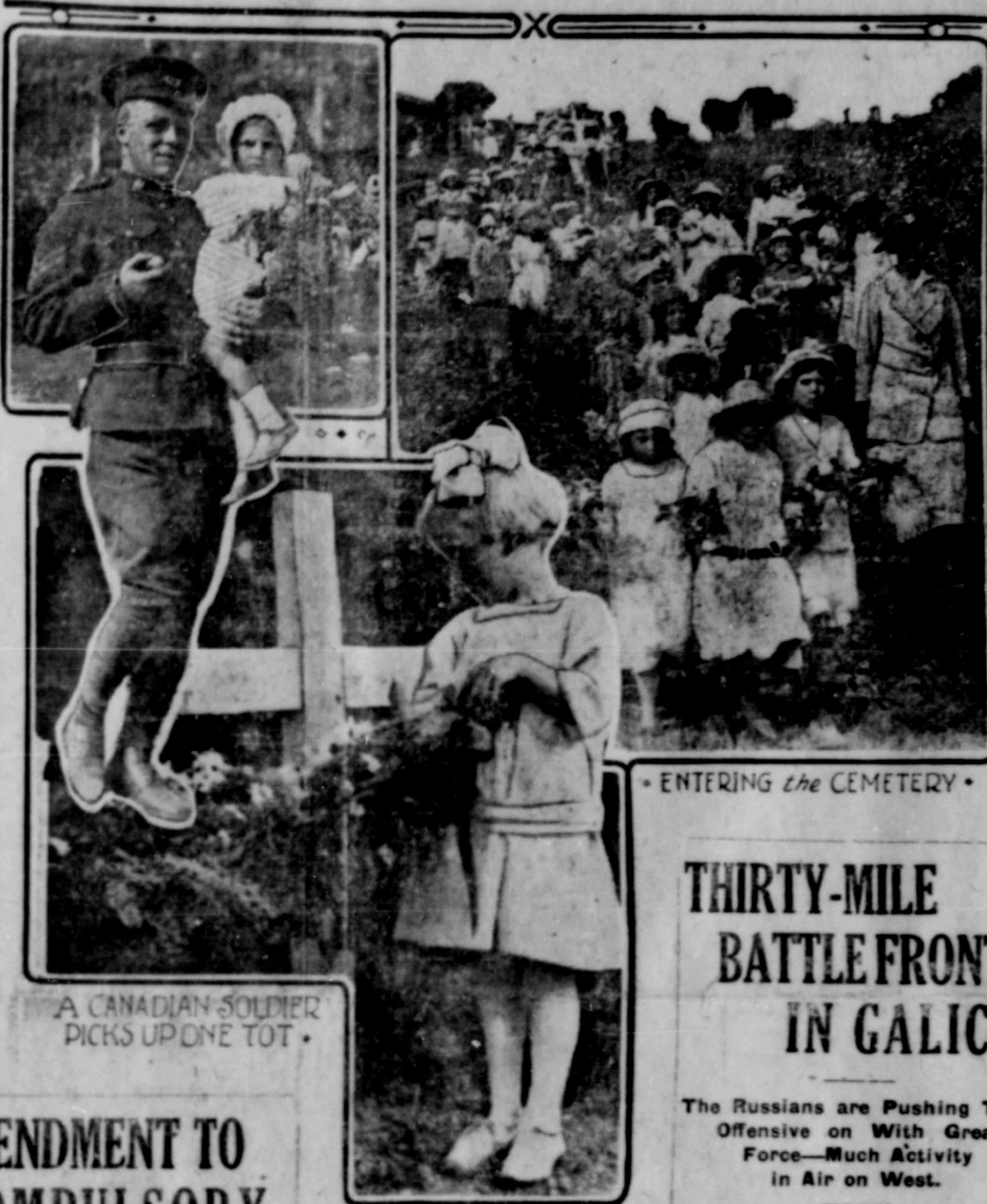
A CANADIAN SOLDIER PICKS UP ONE TOT.

For dressed lumber of all kinds—Albert & McCaffery. Phone 116.