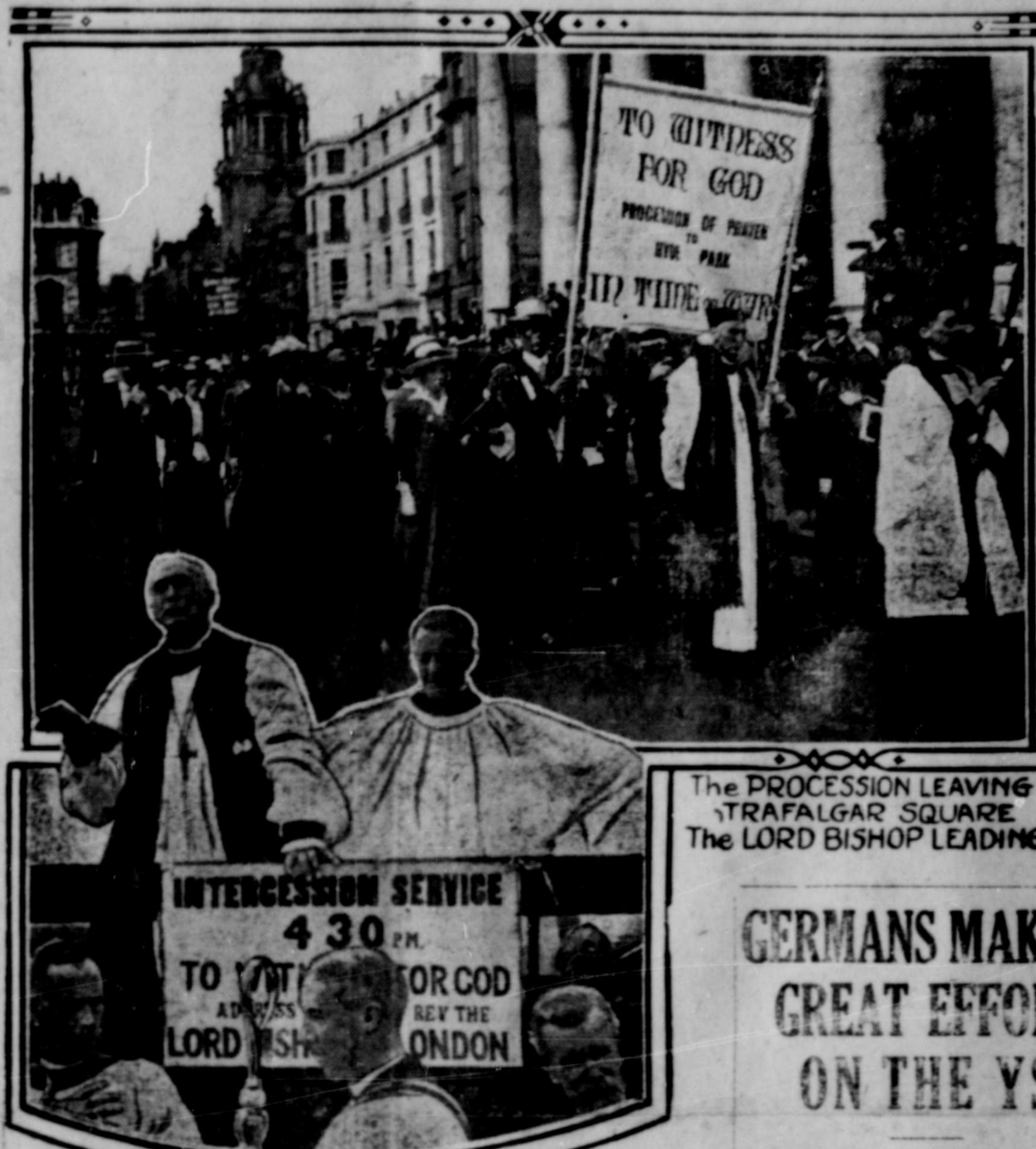
BISHOP of LONDON PREACHING in the PARK

SUN AND TIDE Friday, July 13th. Sun rises.....3:50 a. m. Sun sets.....9:6 p. m. High water.....8:55 a. m., Ht. 15.5 Low water.....2:34 a. m., Ht. 6.1 High water.....10:52 p. m., Ht. 18.9 Low water.....2:14 p. m., Ht. 9.1 A silk blouse for $1.39—Wallace's Sale. For dressed lumber of all kinds—Albert & McCaffery. Phone 116.