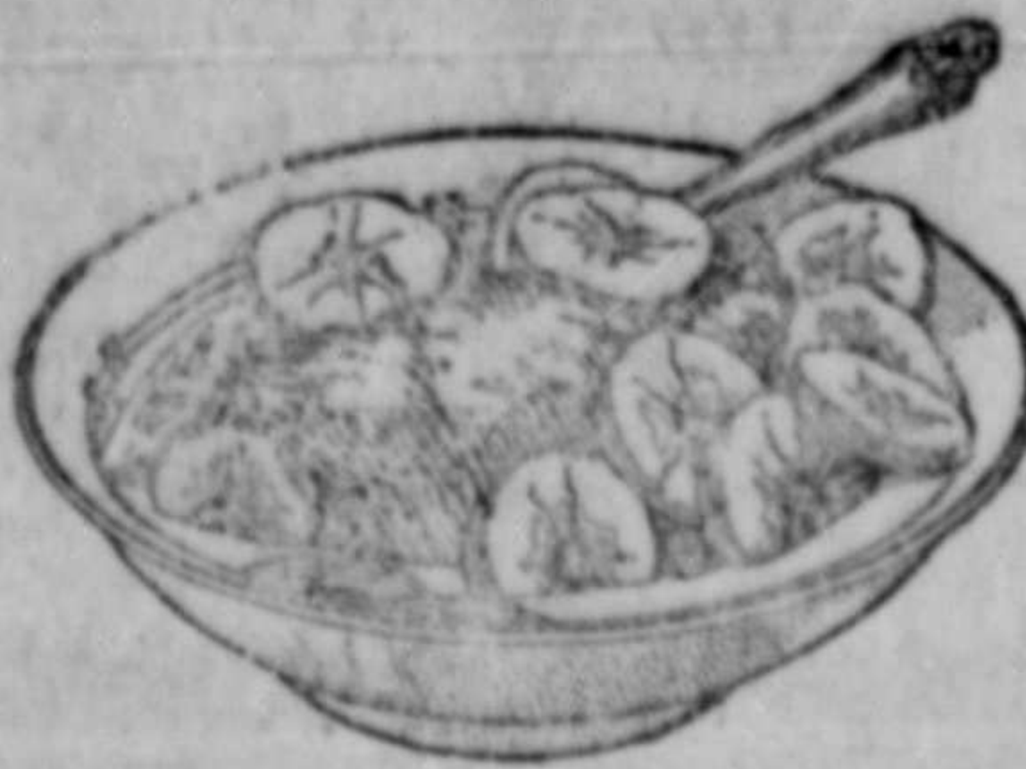
Made in Canada.

The answer is easy in the home where Shredded Wheat Biscuit is the regular every day breakfast cereal. Being ready-cooked and ready-to-eat, Shredded Wheat Biscuit is the joy of the housekeeper in Summer. Served with sliced bananas, berries, or other fruit, they make a nourishing, satisfying meal at a cost of a few cents.