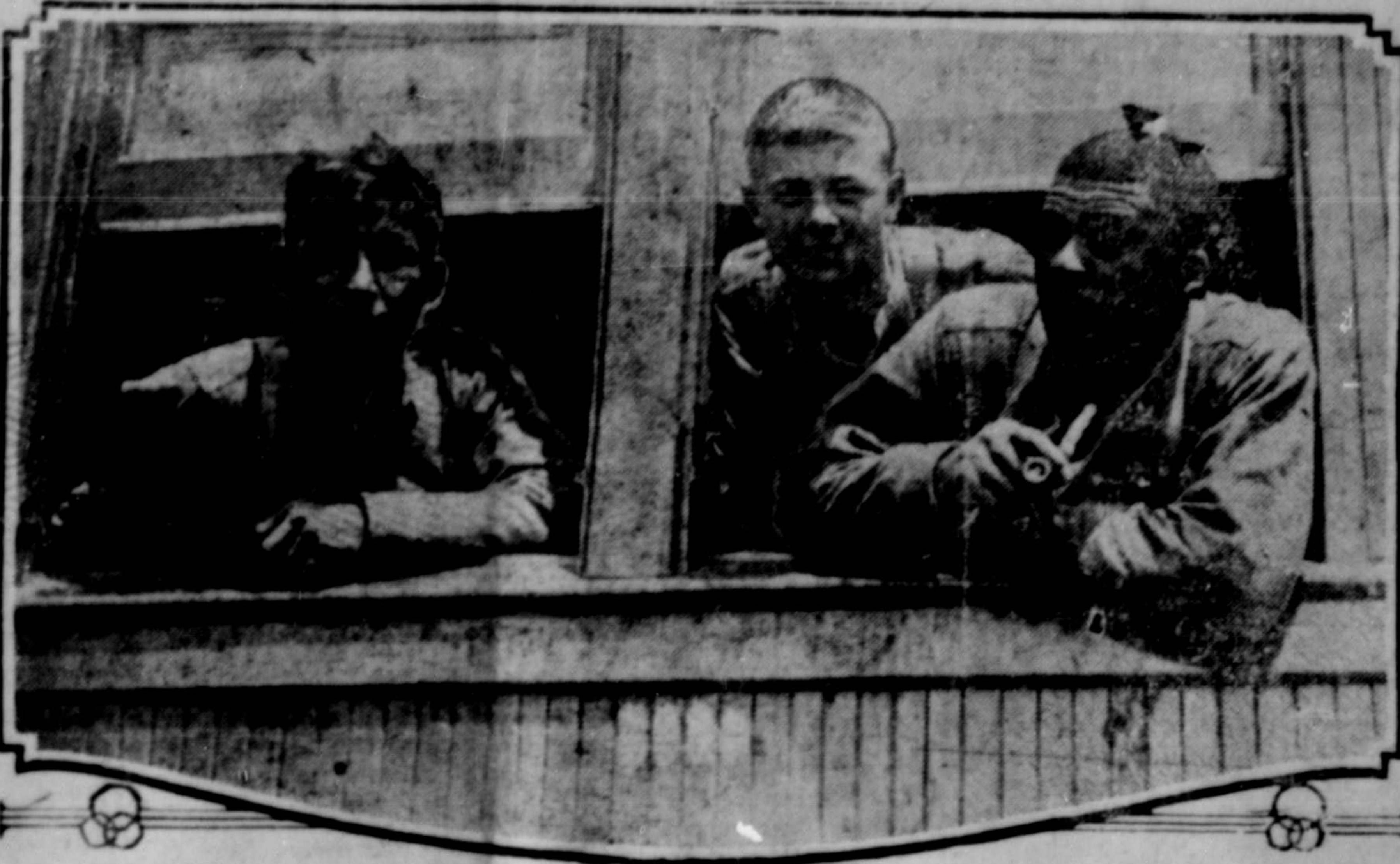
EN ROUTE FOR OVERSEAS SERVICE.—Canada's cosmopolitan army—an Indian, a white man and a negro in a recent Forestry draft travelling on a train to the point of embarkation.

Just arrived, 250 tons of lump coal. Phone 116—Albert & McCaffery.