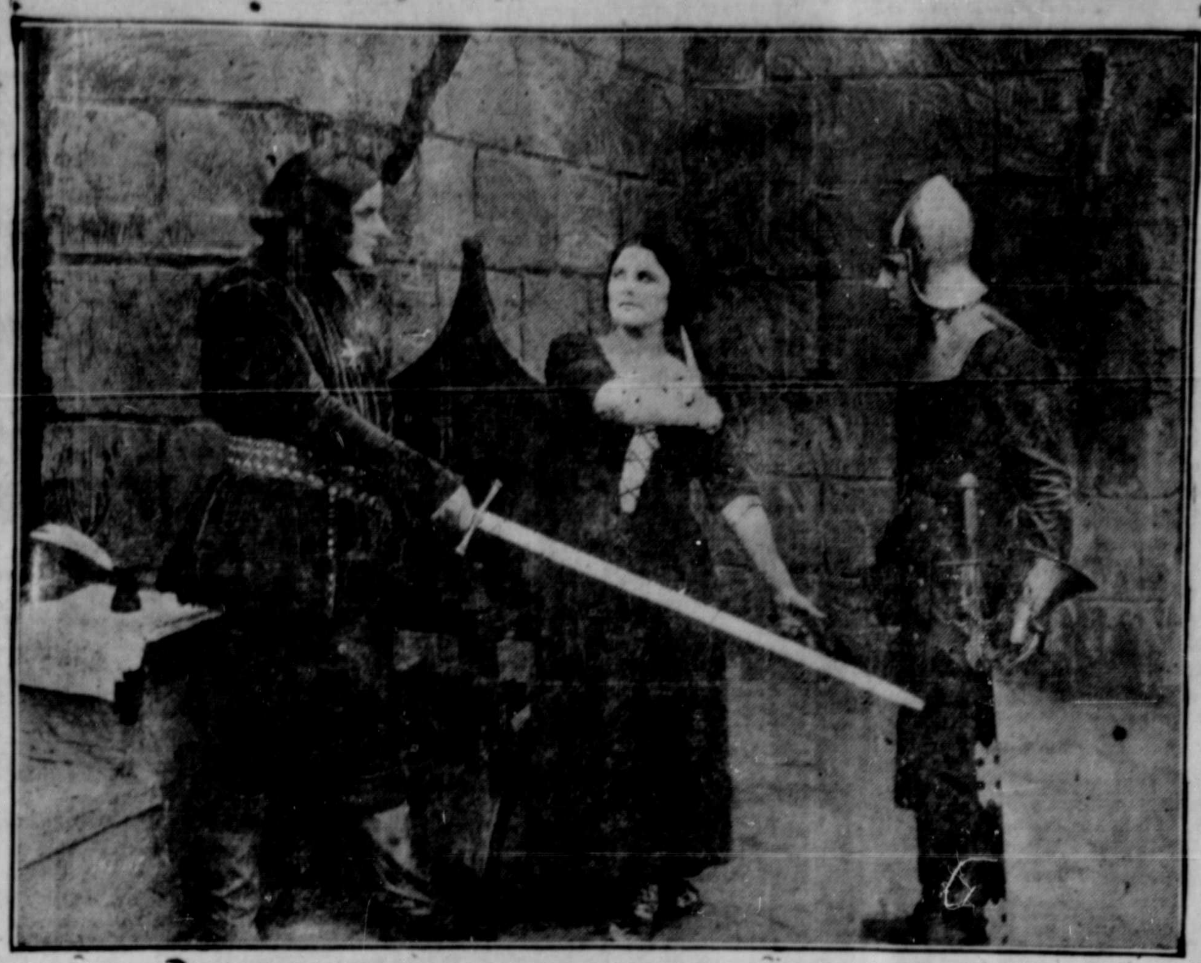
JOAN BREAKS THE GOVERNOR'S SWORD WITH A DAGGER. GERALDINE FARRAR as "JOAN OF ARC," -- in "ELEVEN ACTS," Westholme Theatre, Next Tuesday and Wednesday, 24th and 25th July.

"FRUIT-A-TIVES" is the only medicine in the world that is made from the juices of fresh ripe fruits. Thus, it is manifestly unfair to say, "I won't take Fruit-a-tives because I have tried other remedies and they did me no good". On the other hand, the fact that "Fruit-a-tives" is entirely different from any other preparation in the world, is just why you should give it a fair trial, in any trouble of the Stomach, Liver, Bowels, Kidneys or Skin. "Fruit-a-tives", is composed of the active principle of fruit and the greatest nerve tonic ever discovered. 50c. a box, 6 for $2.50, trial size, 25c. At all dealers or sent postpaid by Fruit-a-tives Limited, Ottawa.