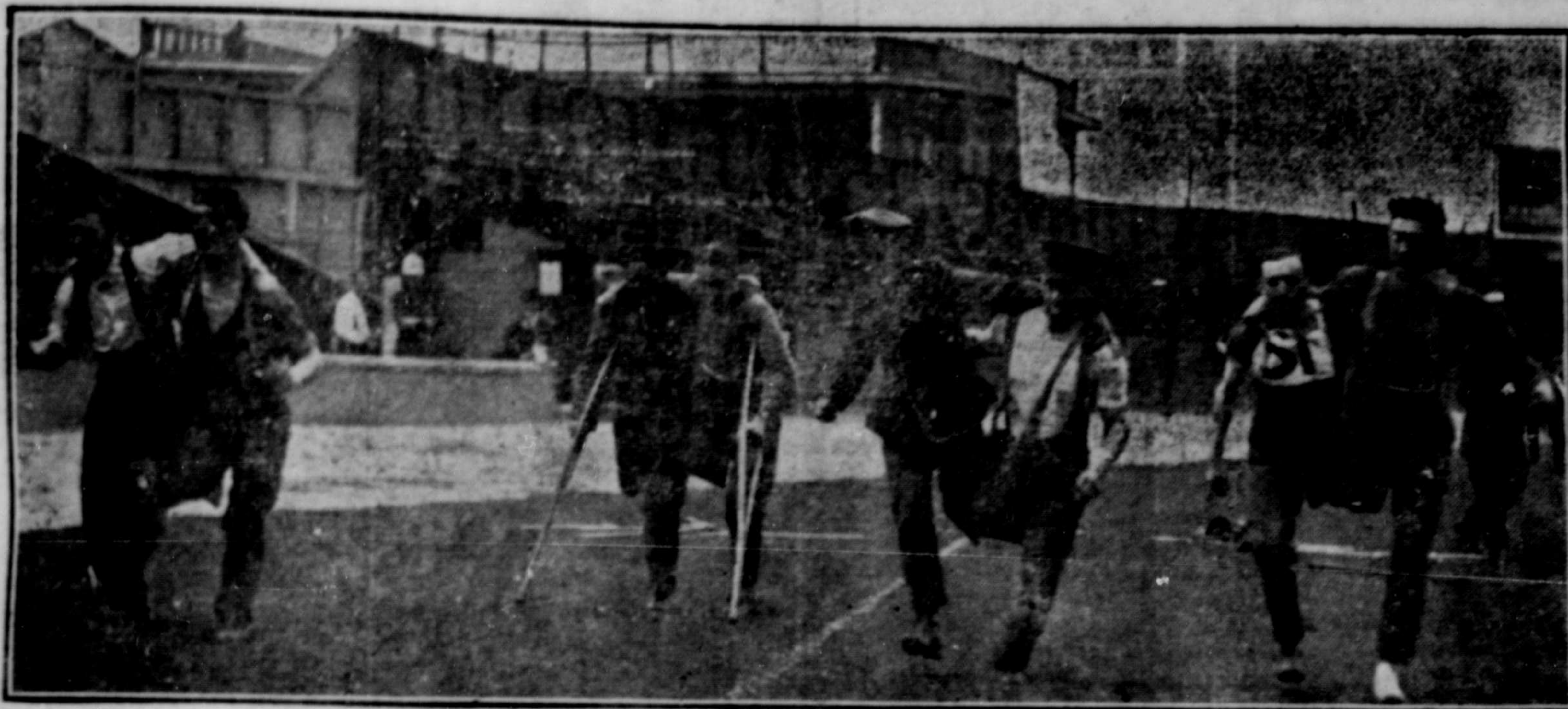
ONE LEGGED WAR VETERANS ON THE RUN, BUT NOT FROM THE GERMANS.—In the photograph, returned Canadian soldiers are competing in a tandem race for one legged men. The competitors made surprising good time and the winning team was presented with a handsome silver trophy. The veterans took great enjoyment out of the progress of sports held for their benefit.

CONSCRIPTION (Special to The Daily News.) Toronto, July 28.—A conference was held of a section of the editors and publishers of some of the Ontario Liberal newspapers. A resolution was passed that they will stand squarely for conscription.