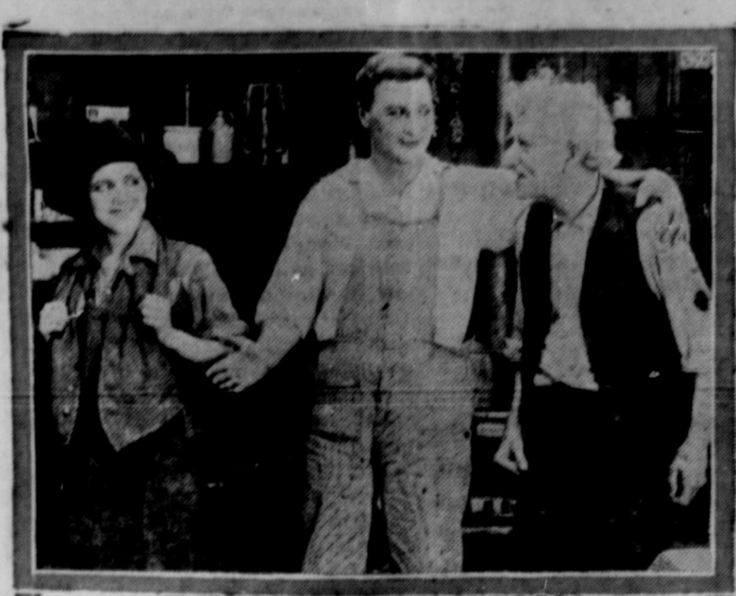
THE RAGGED PRINCESS DIRECTION WILLIAM FOX Showing at the Westholme Theatre tonight.

Concluding its comment, the Journal of Commerce is of the opinion that there need be no fear in the minds of the directors of the company that the Canadian people will be unmindful of the great services, no matter what railway policy may be adopted, which the Grand Trunk Railway Company has rendered to Canada.