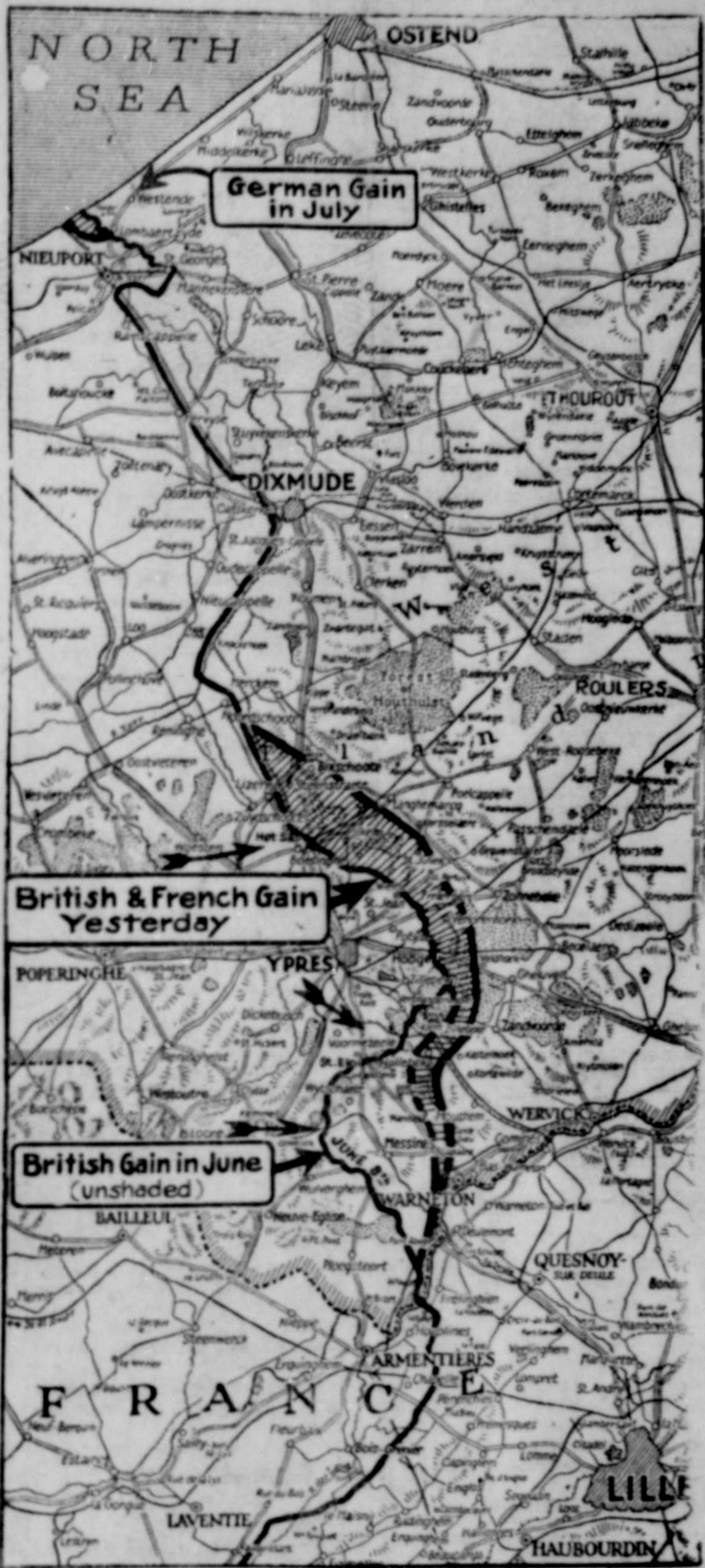
SCENE OF THE BATTLE IN FLANDERS

The New Perfection Oil Cook stove is absolutely safe; is odorless; smokeless; no ashes; no soot; any desired heat can be obtained instantaneously; the flame stays put.