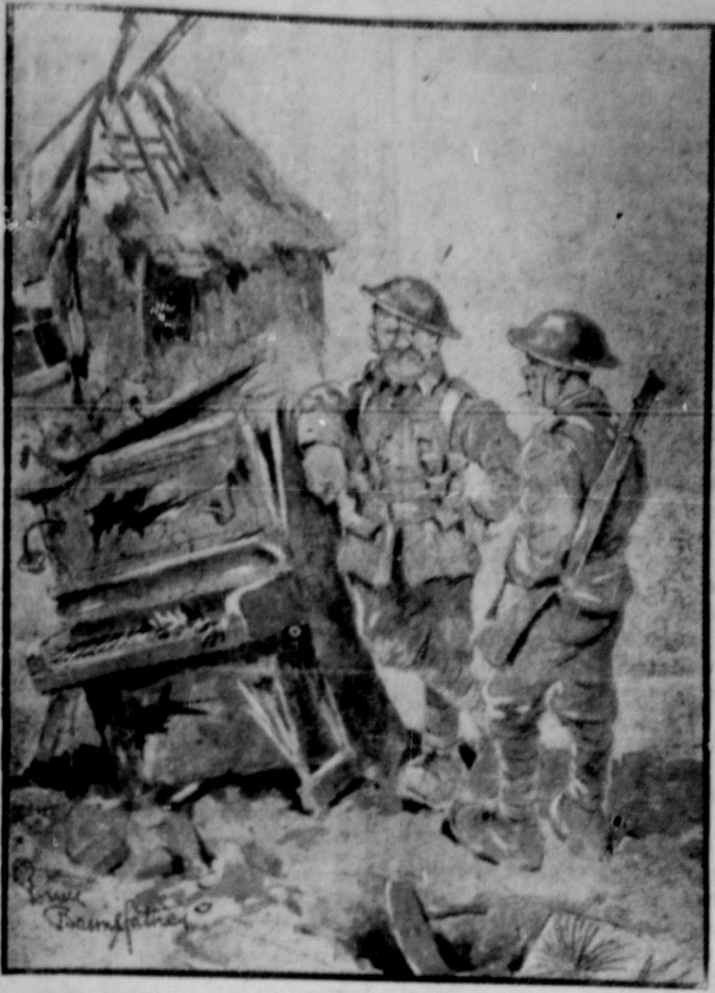
A Puzzle for Pederewski—"It's a pity Alf ain't 'ere, Bert; 'e can play the pyanner wonderful."—London Bystander.