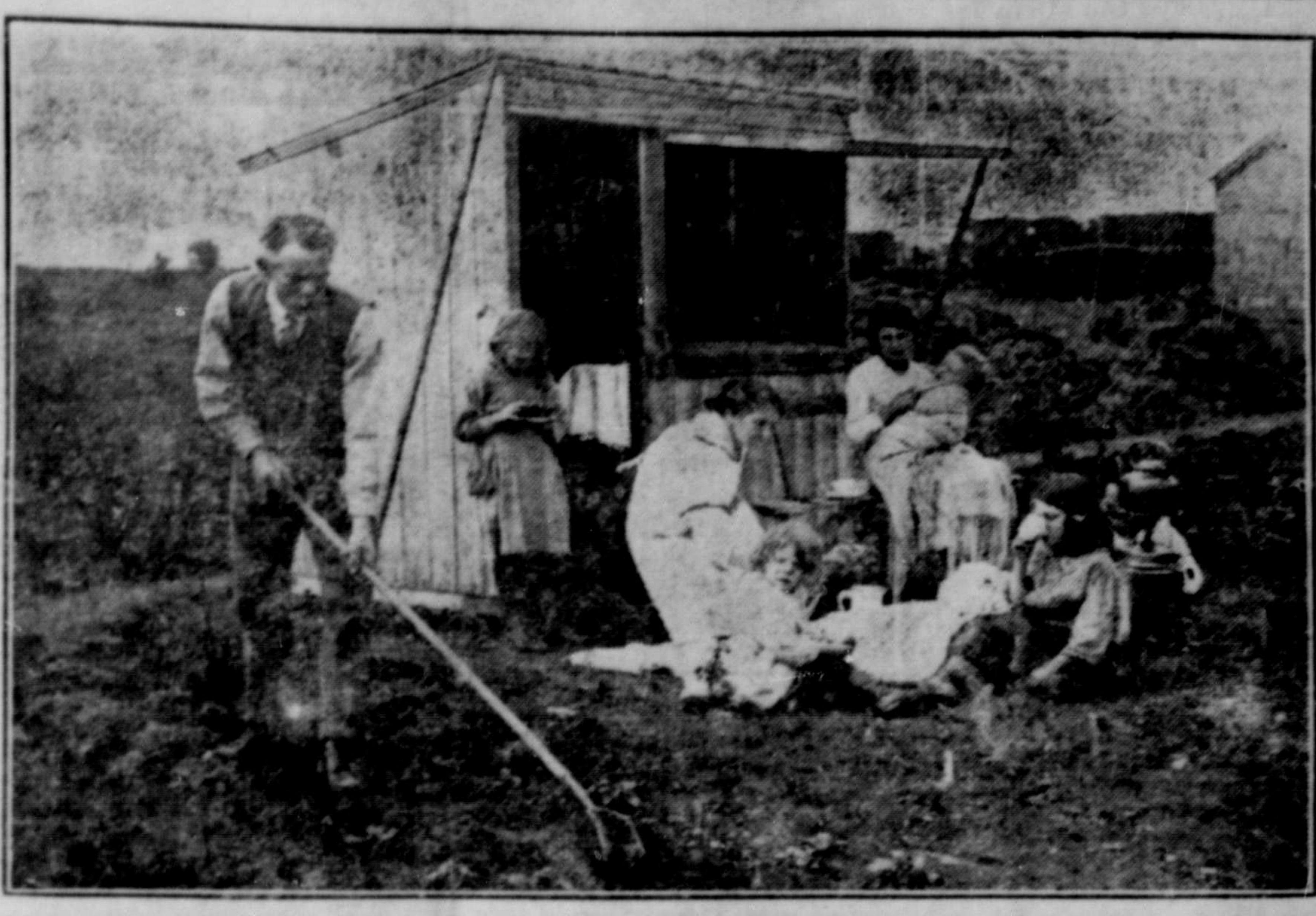
HOW THOUSANDS OF BRITISH FAMILIES ARE HELPING PRODUCTION.—Food production in Great Britain has been largely increased by the cultivation of small plots of ground. Thousands of city families cultivate small garden patches and many families have erected places like this, on their allotments.

Just arrived, 250 tons of lump coal. Phone 116—Albert & McCaffery.