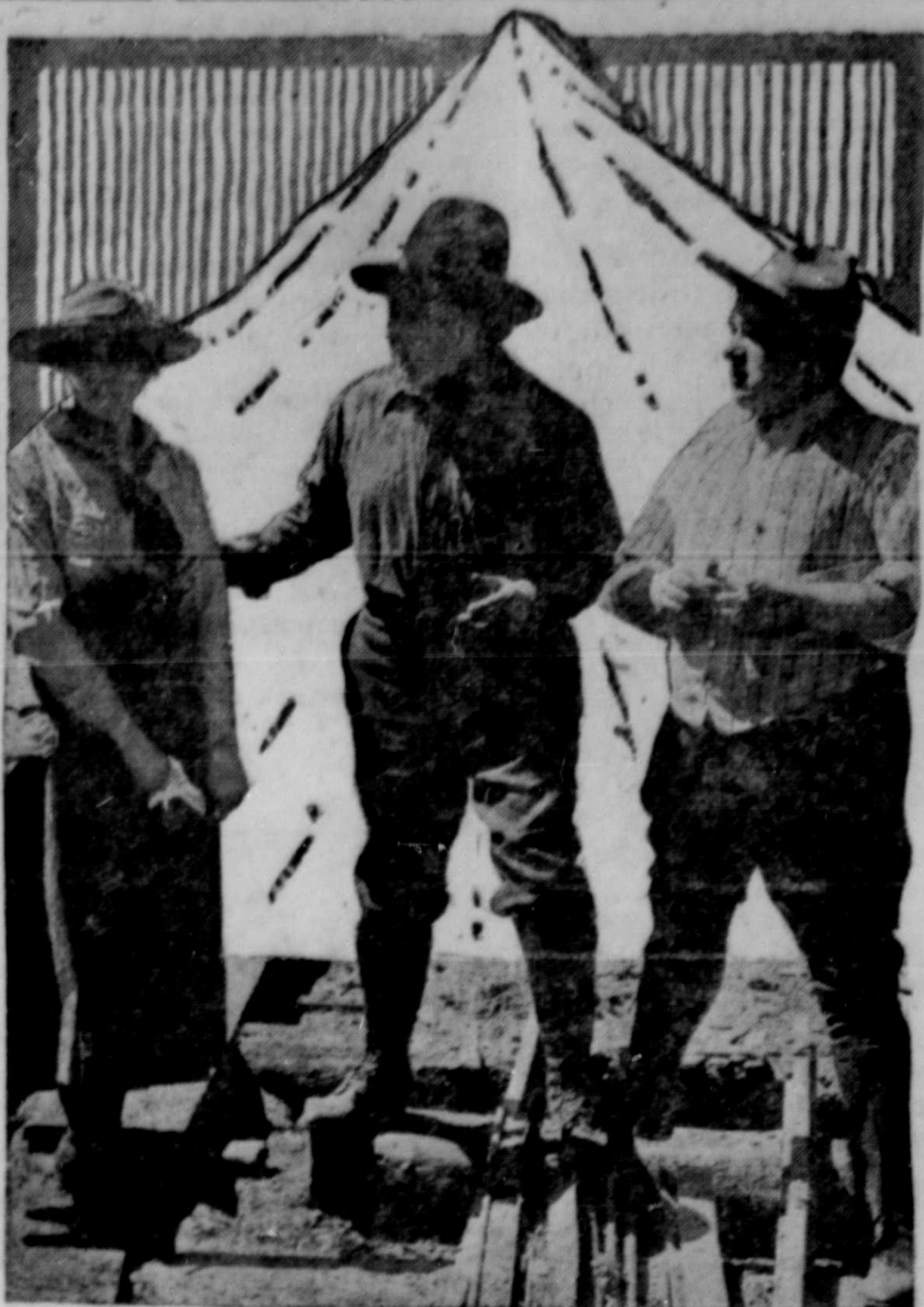
THE MAN FROM BITTER ROOTS WILLIAM FOX PRODUCTION Showing at the Westholme Theatre tonight.

Again he says: "In view of any possible effort on the part of the