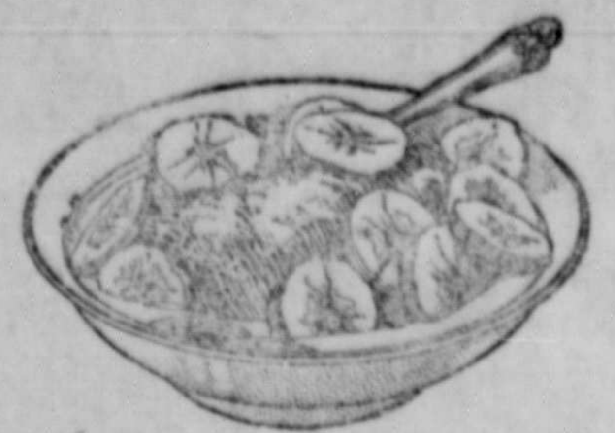
Made in Canada.

The answer is easy in the home where Shredded Wheat Biscuit is the regular every day breakfast cereal. Being ready-cooked and ready-to-eat, Shredded Wheat Biscuit is the joy of the housekeeper in Summer. Served with sliced bananas, berries, or other fruit, they make a nourishing, satisfying meal at a cost of a few cents.