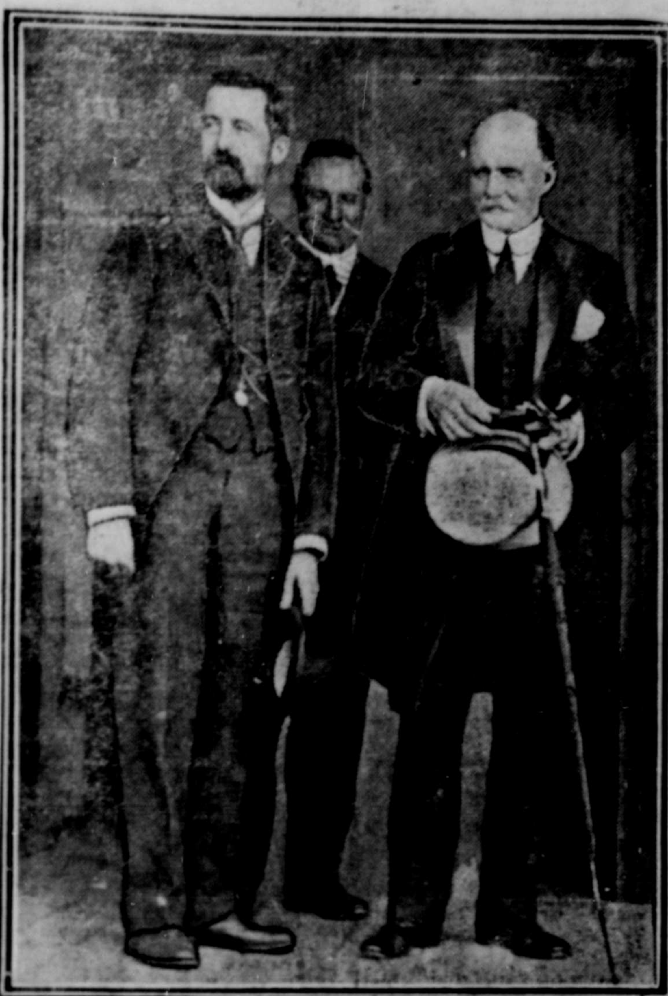
ONTARIO'S ORPINGTON HOSPITAL GROWS Mr. Walter Long, Colonial Secretary, visited Orpington to open the extension of the Ontario Military Hospital, a golden key being presented for the purpose. The photo shows Sir George Perley, acting Canadian High Commissioner (left), and Mr. Walter Long, (right).