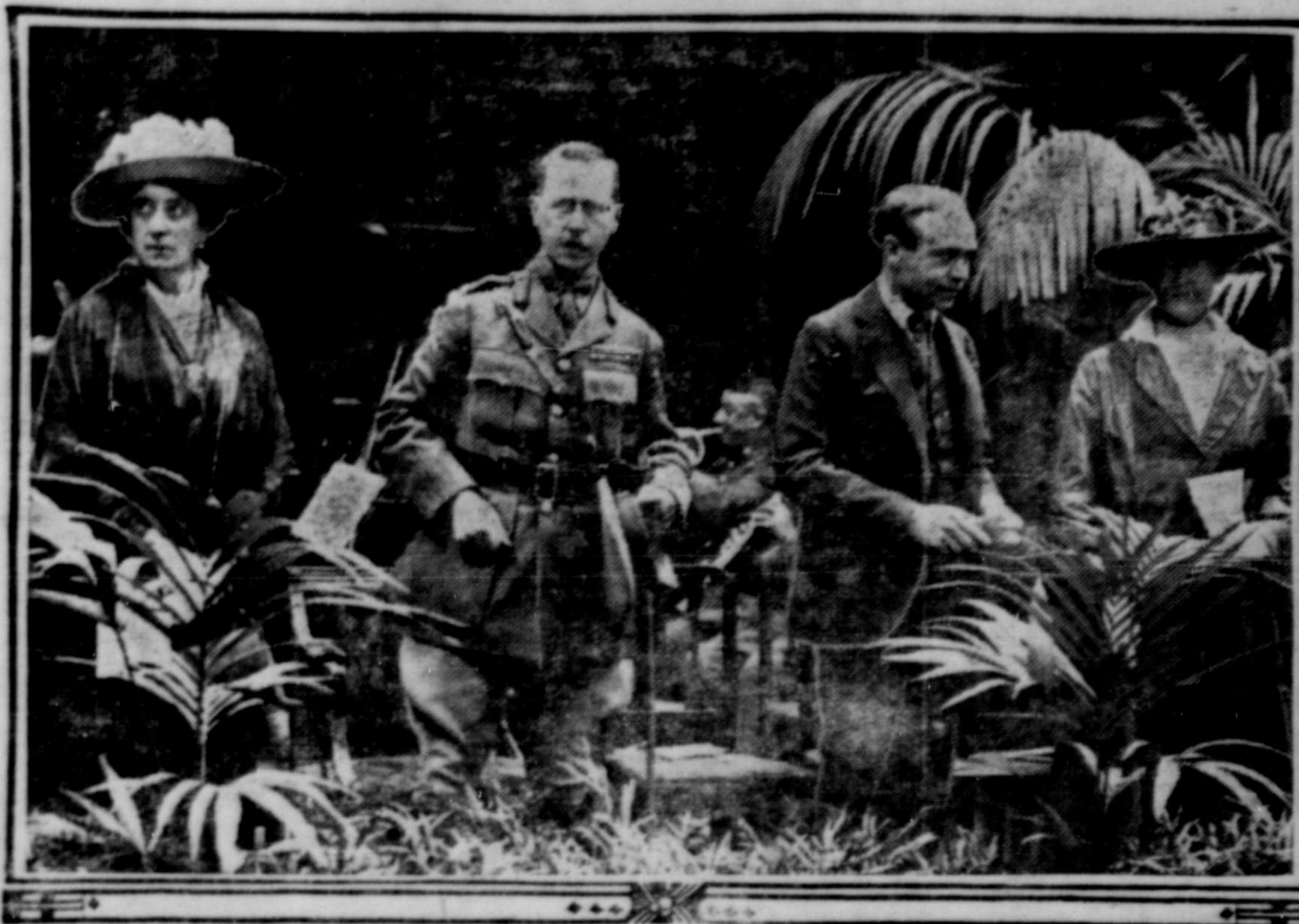
LADY BYNG, MAJOR GENERAL TURNER, V. C., LORD BEAVERBROOK AND LADY TURNER A group of persons prominent in Canadian affairs were here pictured at an exhibition of Canadian war pictures. Lady Byng is the wife of the former Canadian Commander. Sir R. E. W. Turner is head of the Canadian army in England, and Lord Beaverbrook is the Canadian wonder.

The favorite household Coal is Ladysmith Wellington. Phone 15, Prince Rupert Coal Co.