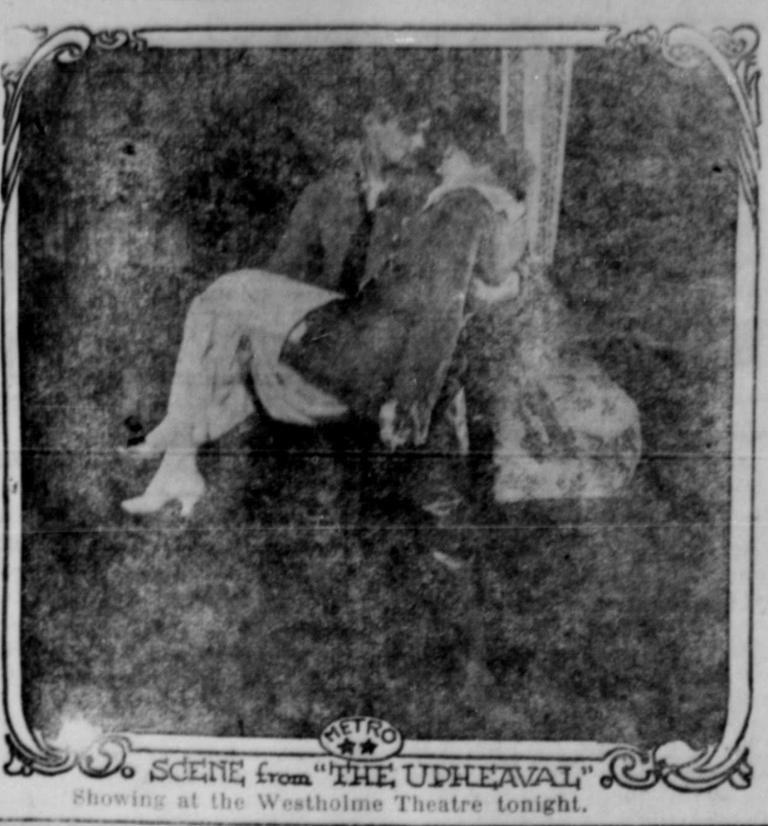
SCENE from "THE UPHEAVAL" Showing at the Westholme Theatre tonight.

DISTRICT OF COAST, Range 5. Take notice that I, Hugh McLean, intend to apply for a licence to prospect for coal and petroleum on the following described lands:—Commencing at a post planted one mile south of the southwest corner of N. McLean's No. 2 claim, being about one and a half miles north of the Beaver river; thence north 80 chains; thence east 80 chains; thence south 80 chains to the point of commencement, containing 640 acres, to be known as H. McLean's No. 7 claim. Located May 22nd, 1917. HUGH McLEAN, per Philip Chesley, Agent.