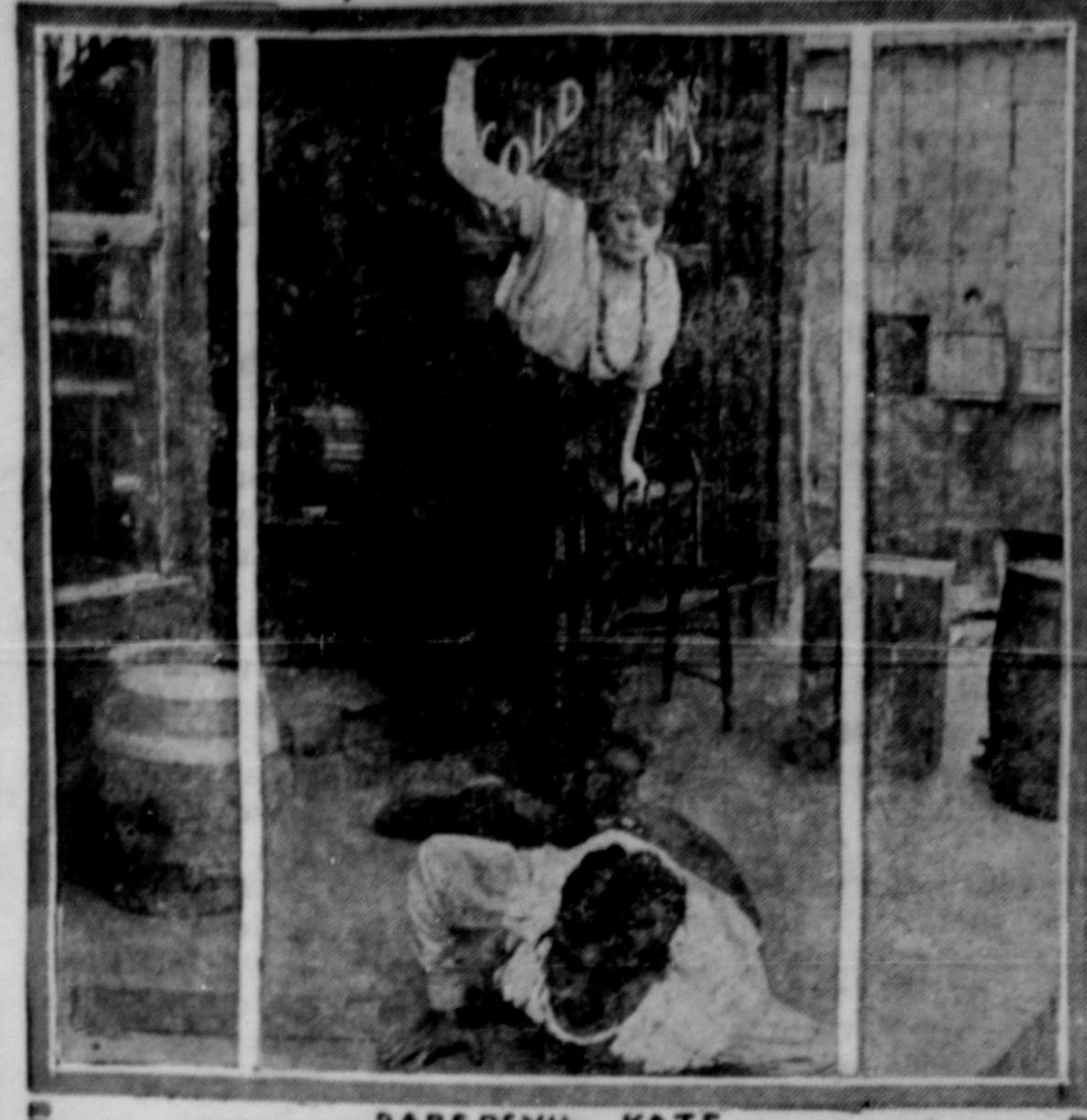
WILLIAM BARDEWIL, KATE PRODUCTION, Showing at the Westholme Theatre tonight.

R. S. C. Chapter 115. The Grand Trunk Pacific Railway Company hereby gives notice that it has, under Section 7 of the said Act, deposited with the Minister of Public Works at Ottawa, and in the office of the District Registrar of the Land Registry Office, District of Prince Rupert, at Prince Rupert, a description of the site and plan of wharf and fish curing plant and other works proposed to be built in Prince Rupert harbor at Prince Rupert, British Columbia, in front of Waterfront Block "I," according to registered plan of the townsite of the said City of Prince Rupert registered in the aforesaid land registry office as No. 923, Section 7. AND TAKE NOTICE that after the expiration of one month from the date of the first publication of this notice, the Grand Trunk Pacific Railway Company will, under Section 7 of the said Act, apply to the Minister of Public Works at his office in the City of Ottawa for approval of the said site and plan and for leave to construct the said works. DATED at Prince Rupert, British Columbia, this 16th day of June, A. D. 1917. THE GRAND TRUNK PACIFIC RAILWAY COMPANY, Patmore & Fulton, Solicitors.