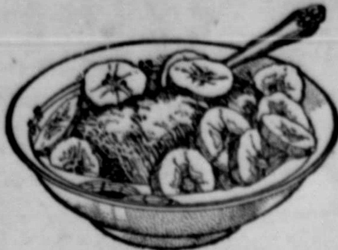
Made in Canada.

In These War Times you want real food that contains the greatest amount of body-building material at lowest cost. The whole wheat grain is all food. Shredded Wheat Biscuit is the whole wheat in a digestible form. Two or three of these little loaves of baked whole wheat with milk and a little fruit make a nourishing, strengthening meal.