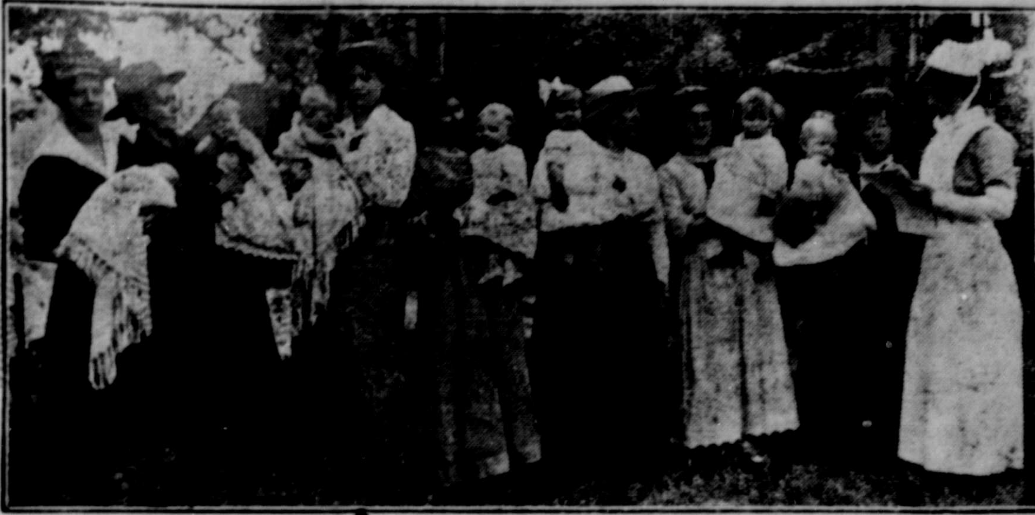
PREPARING IN GREAT BRITAIN FOR NATIONAL BABY WEEK.—Scene at the local maternity centre at Westcliffe on Sea, England, where over 900 babies have been brought up since it was opened, the mortality being the lowest on record. National baby week was decided upon in Great Britain to emphasize and encourage the great national campaign in the Old Country to help the people and the nation by scientifically promoting the welfare of British babies.

Berlin, August 17.—The refusal of the Entente powers to grant passports to their delegates to the Stockholm Conference shows that Great Britain and the United States are determined upon Germany's destruction.