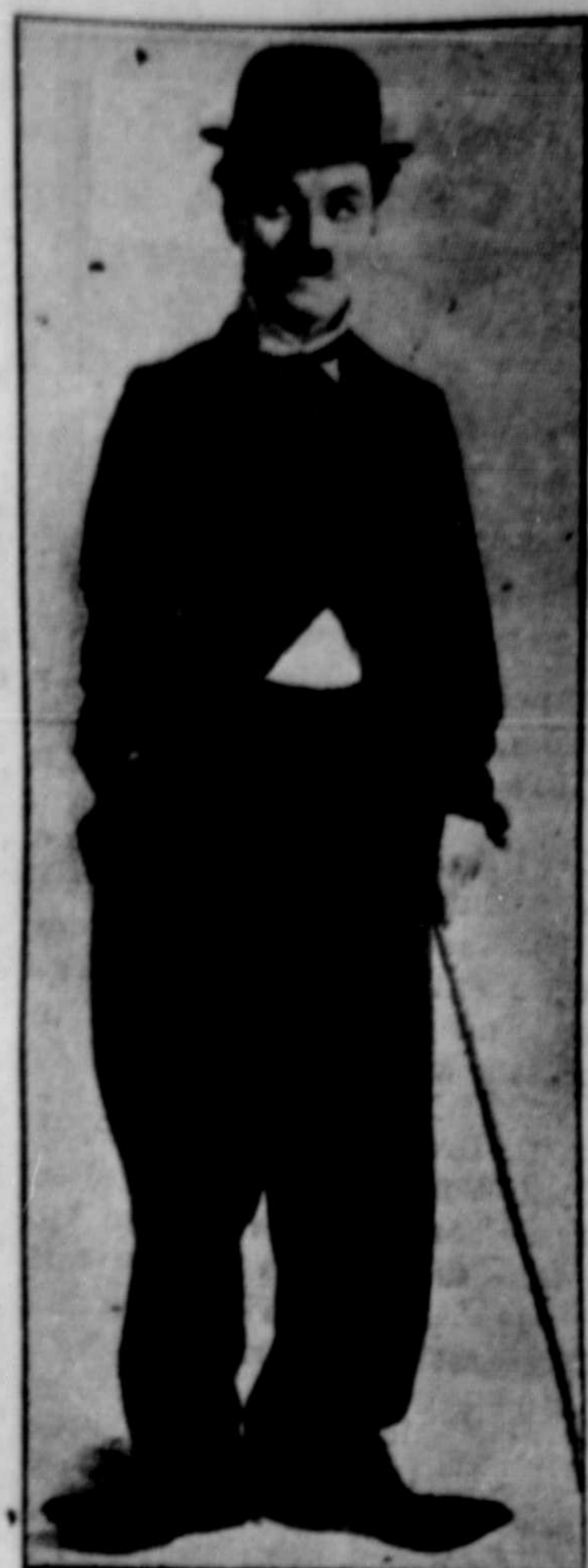
Showing at the Westholme Theatre tonight.