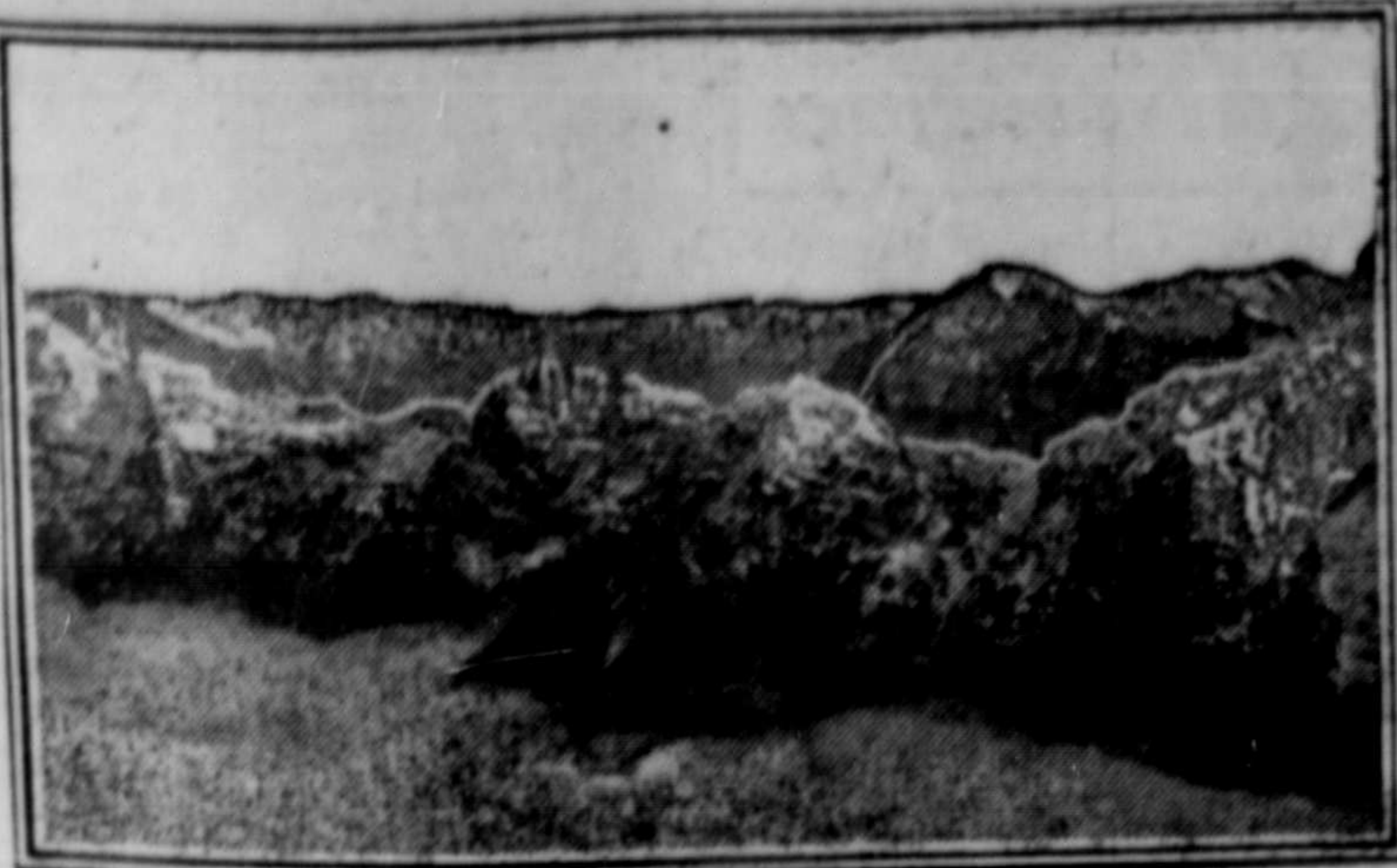
MOUNT NERO—ONE OF THE CAPTURED PEAKS. The Italians have overcome tremendous difficulties in their offensive against the Austrians in the Carnic Alps. Mount Nero, one of the captured peaks, is shown in this photograph.

DATED at Prince Rupert, British Columbia, this 4th day of July, A. D. 1917. THE GRANBY CONSOLIDATED MINING, SMELTING AND POWER COMPANY LIMITED, Patmore & Fulton, Solicitors.