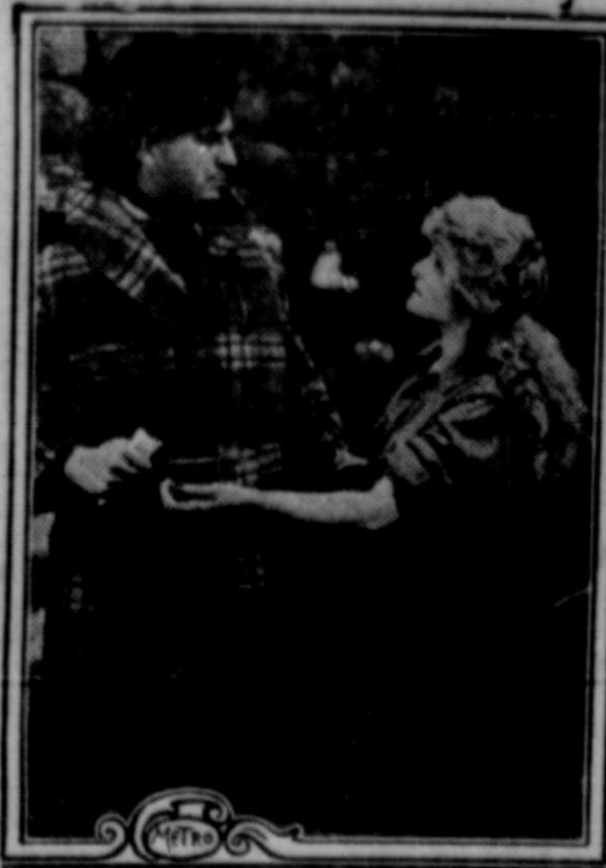
Scenes from "THE COME BACK."

Showing at the Westholme Theatre tonight.