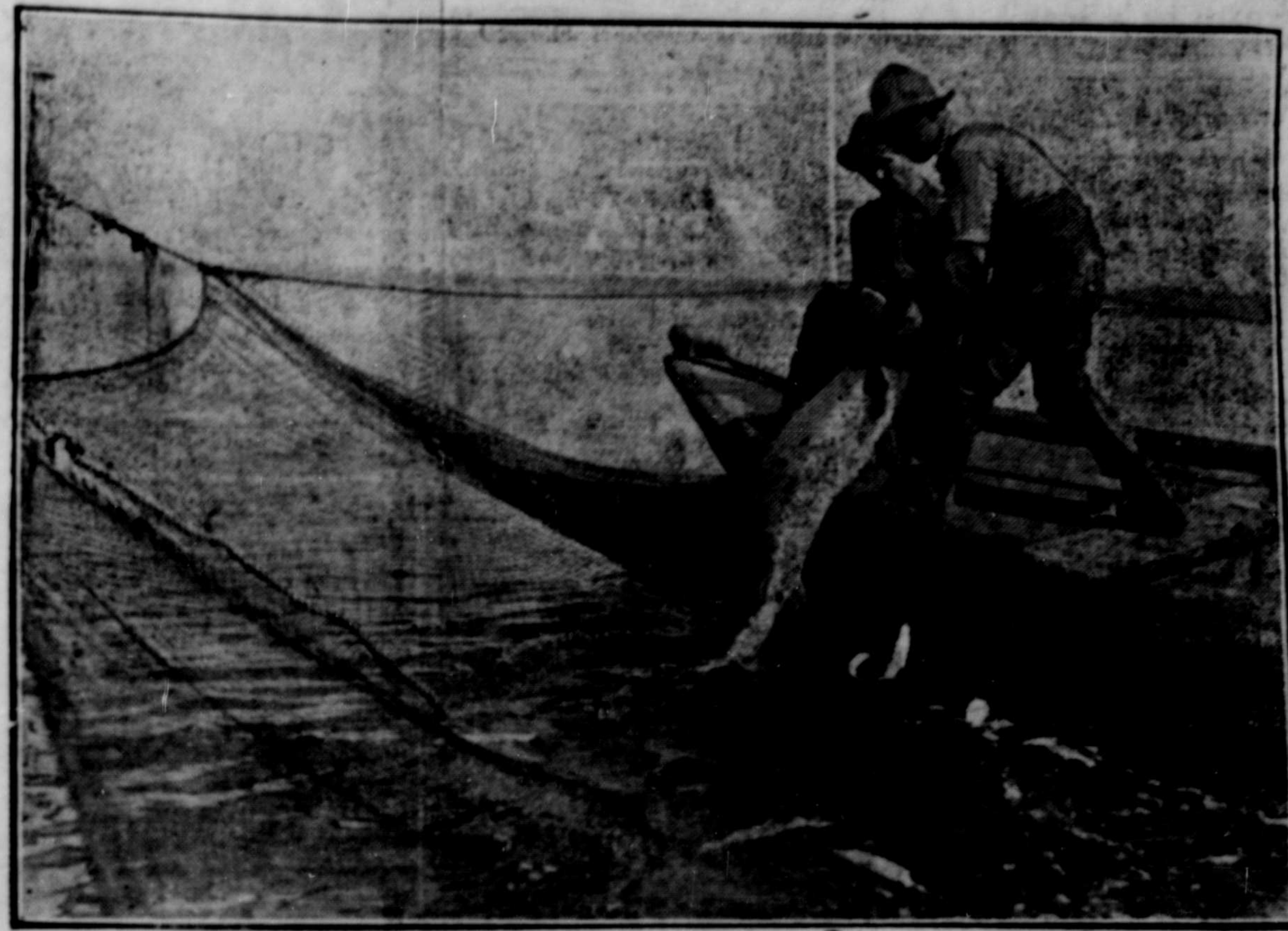
LANDING MONSTER STURGEON OVER SIX FEET LONG.—"Haul away boys." A rather ticklish job is the handling of a monster sturgeon. This photo was taken on Lake Huron. The sturgeon is frequently caught in pound nets, and the fisherman first hits the great fish a whack on the head with a big hammer before attempting to get it into the boat.

(Special to The Daily News.) London, August 24.—Chatham House at Ramsgate, used as the Canadian Military Hospital, with the adjoining Townley Castle, was bombed in the air raid on Wednesday, when ten German raiding machines appeared over the Kent coast. A huge Red Cross was spread on the ground to indicate the character of the building and such could not have failed to have been visible from the air. Notwithstanding this, bombs were dropped direct on the buildings used as hospitals, two wards being reduced to matchwood and scrap iron. One invalided soldier was killed and a number of others injured.