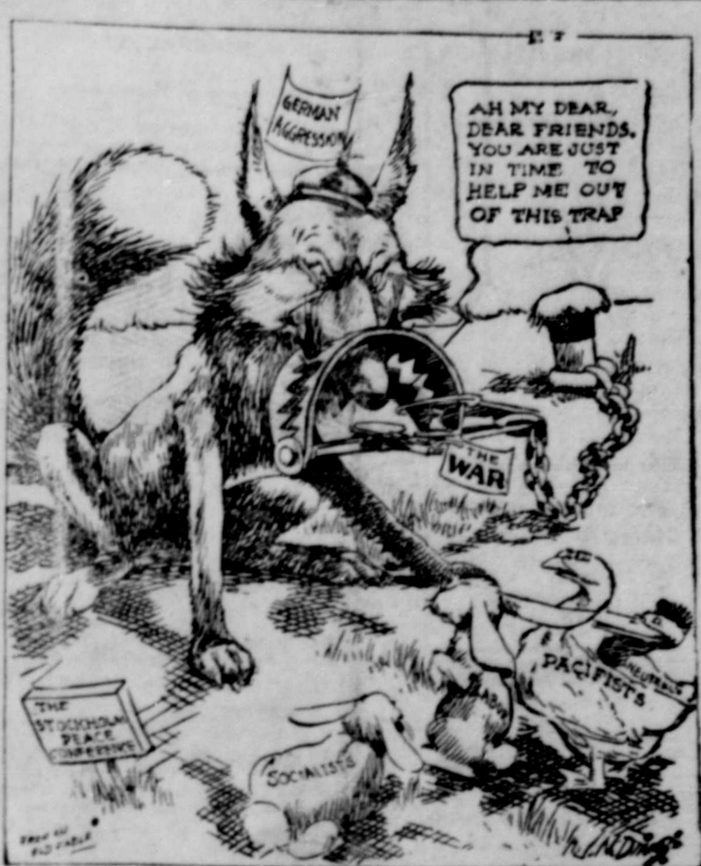
Are they going to be fool enough to do it?—New York Tribune.