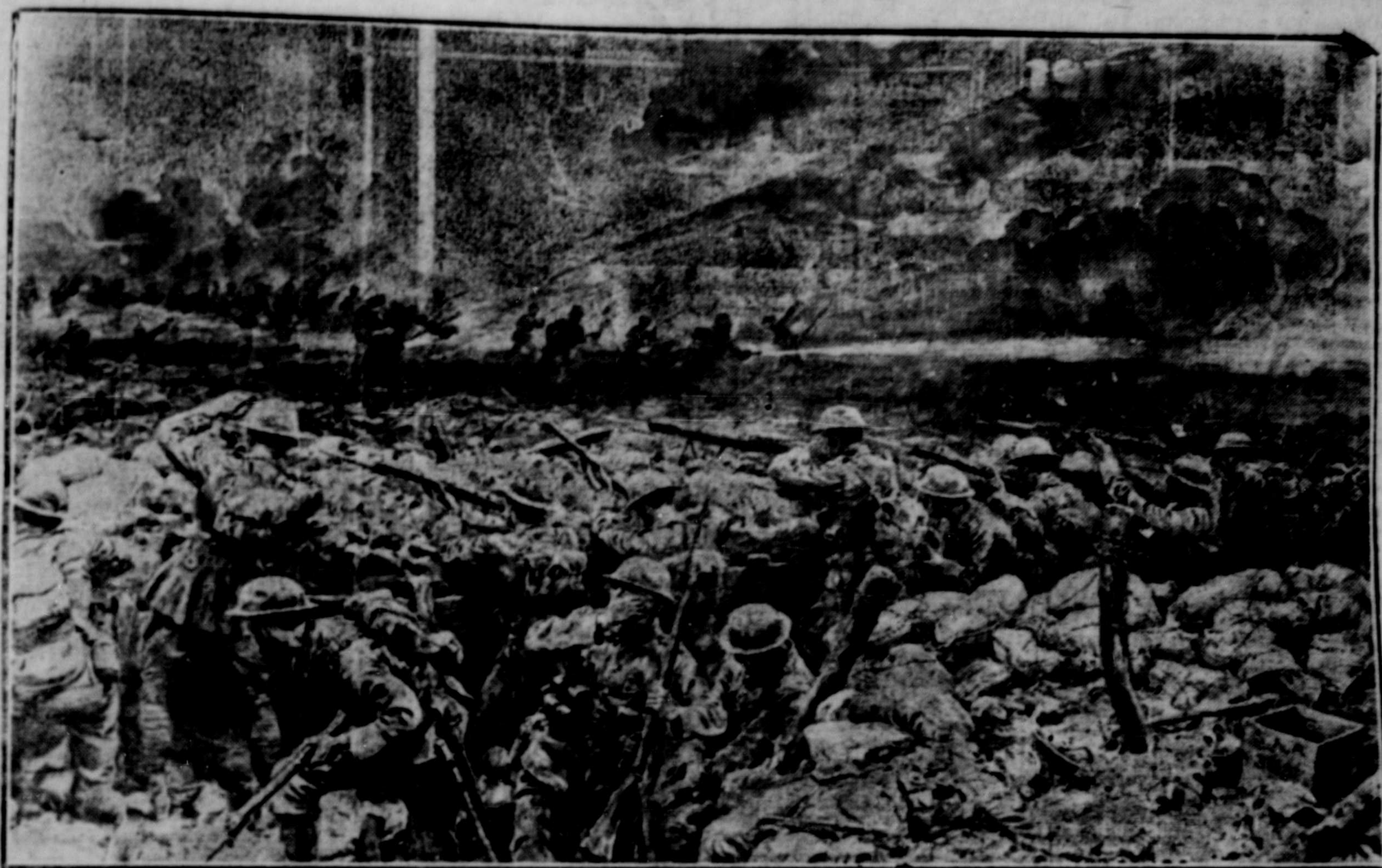
BEATING BACK THE GERMANS ATTACKING WITH SMOKE CLOUDS AND LIQUID FIRE.—A military correspondent on the western front writes, "During the recent German offensive on a portion of the line where the trenches were close, a heavy enemy bombardment was followed by smoke clouds, and the German attack preceded by men in armor, carrying portable flame projectors. The British trenches, which have been badly knocked about, were subjected to fire jets from these machines."