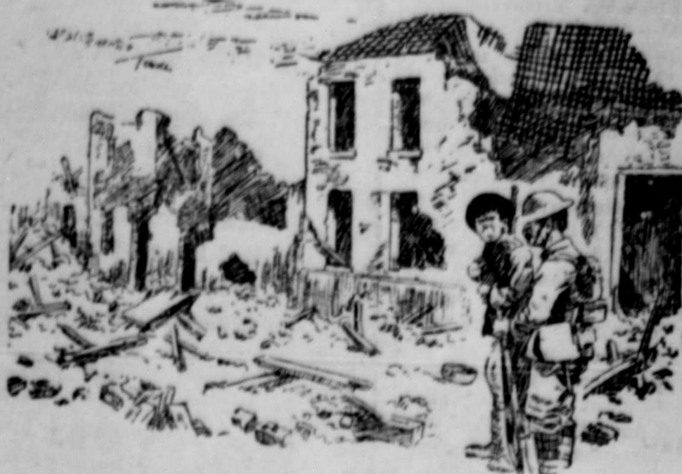
ON THE ADVANCE.—"I likes this 'ere village a deuce of a lot better nor the last one, Jim."—London Opinion.