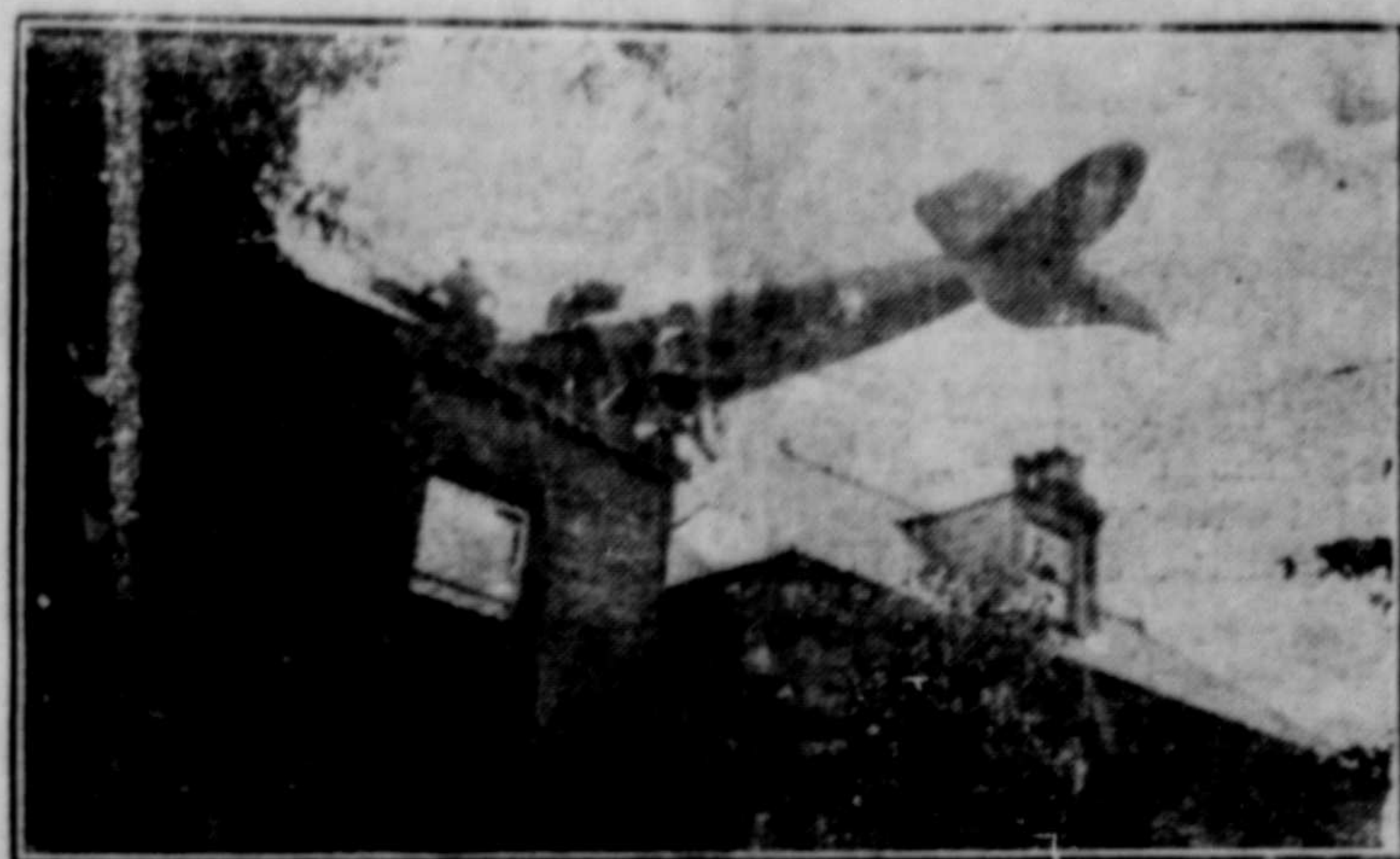
FORGOT TO KNOCK—AEROPLANE ENTERS BED-ROOM

Ald. Casey continued that public ownership would be applied in the very near future to many other commodities than coal, al-