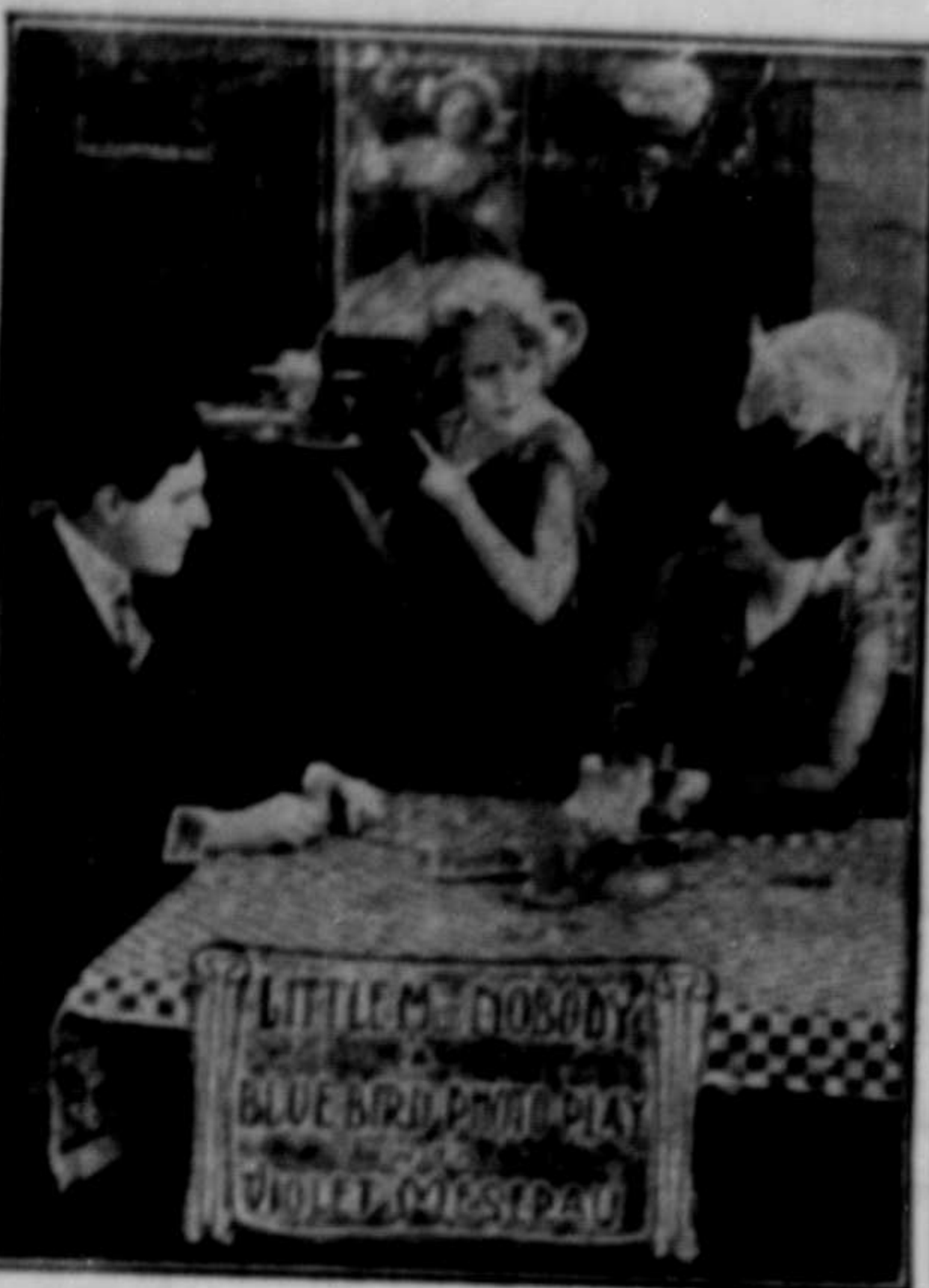
Showing at the Westholme Theatre tonight.