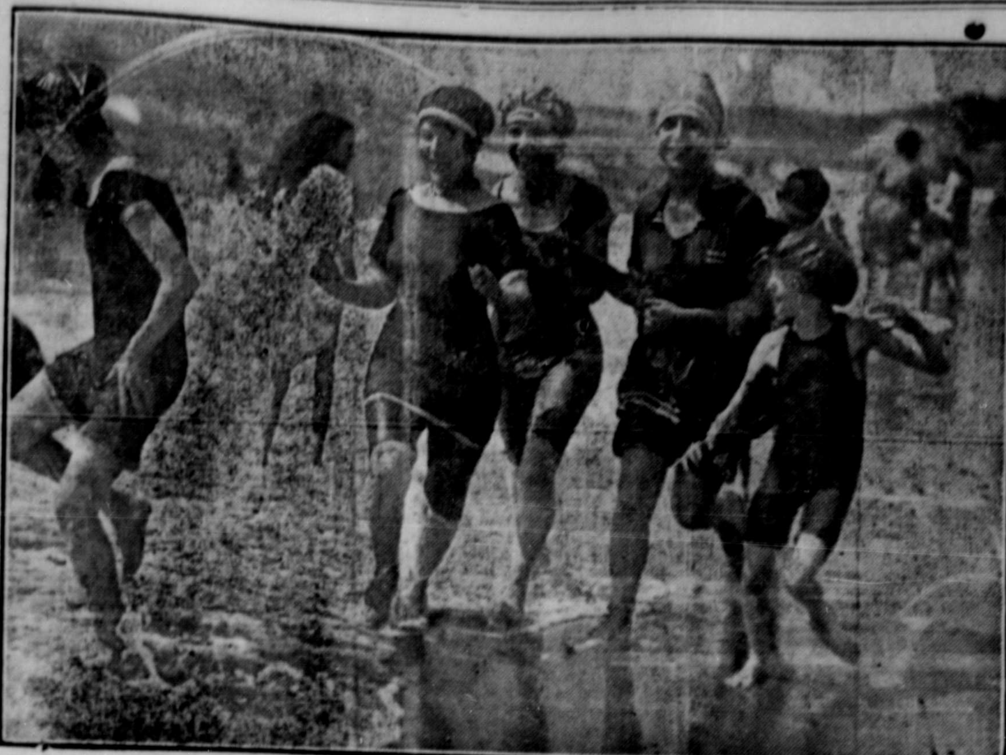
BOURNEMOUTH'S SEA NYMPHS.—The rush to the seaside in England still continues and large crowds of sea bathers are to be seen now at Bournemouth. This photo shows some of them ready for their morning dip.