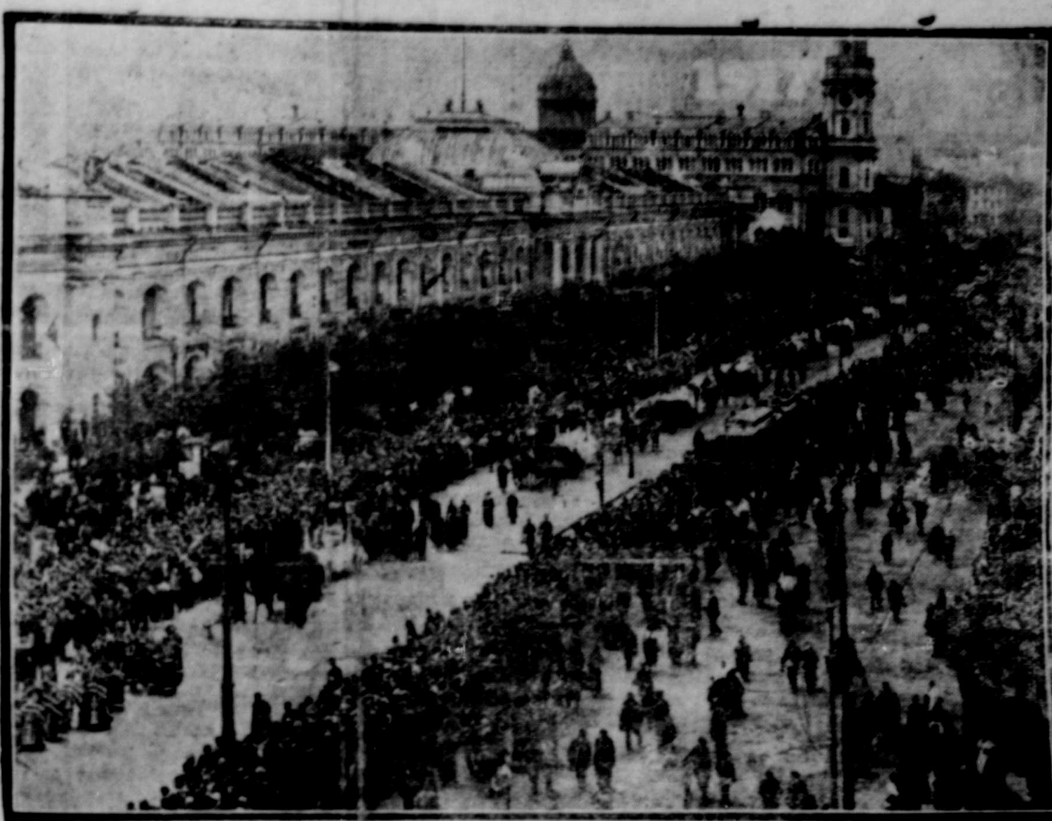
THE DEPOSED CZAR'S PALACE.—The summer palace at Tsarkoe Selo, which Nicholas Romanoff exchanged for apartments at Tobolsk.

China's Help. Tokio, Sept. 22.—China has been sounding Japan regarding the sending of troops to Europe. Japan has made no objection to China sending three hundred thousand men.