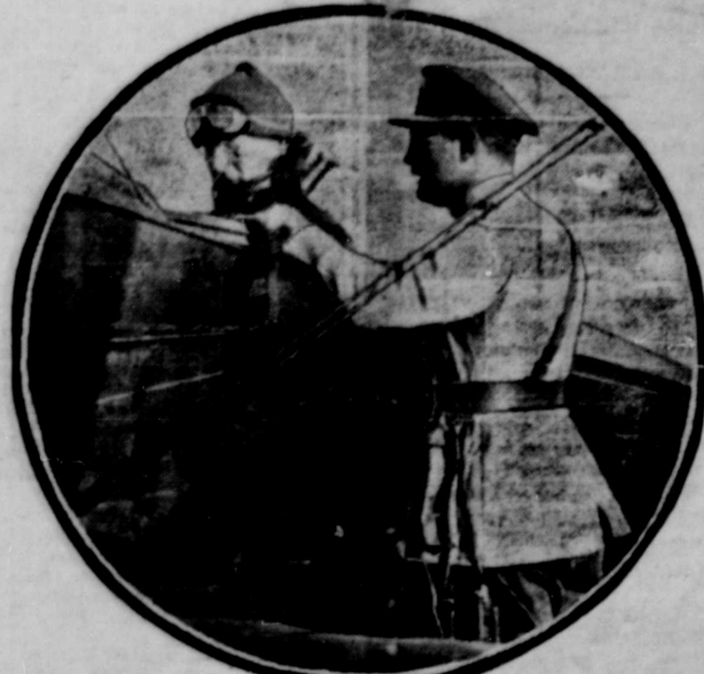
KING ALBERT OF BELGIUM AN AIRMAN

For New Wellington Coal and Fir Lumber of all dimensions, phone 116.