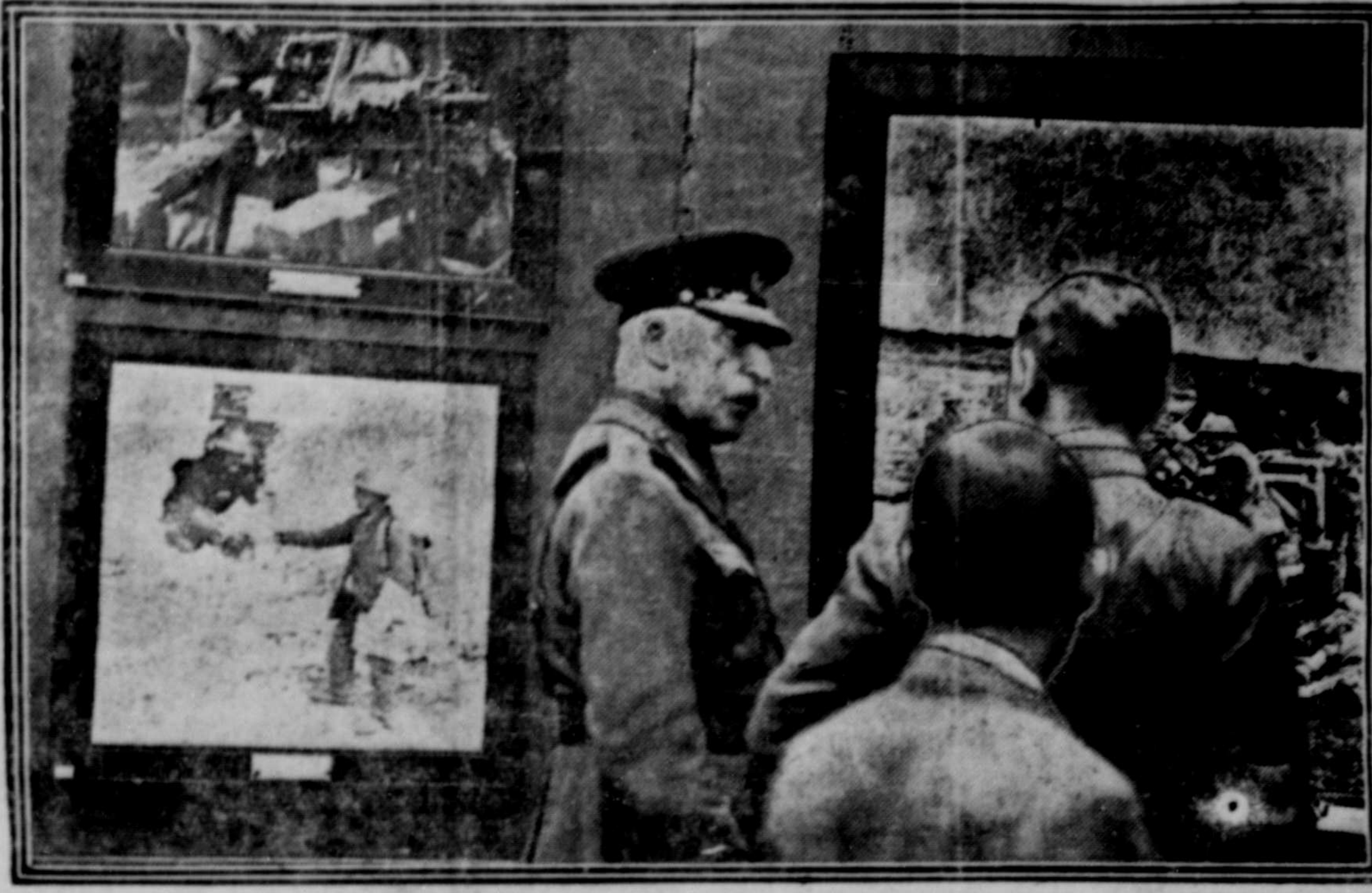
DUKE OF CONNAUGHT VIEWS WAR PICTURES. —This photograph shows the Duke of Connaught on a recent visit to the Canadian official pictures of the war, which are on exhibition in Grafton Gallery, London.

The "Revue des Deux Mondes" publishes an article giving detailed information on the present situation of the German army after the battles of Verdun and the Somme. The writer says:—The Germans recognized that their superiority was lost, and were anxious to recover it. Therefore, from the beginning of 1917 a programme was decided upon involving the creation of 30 new divisions and a new German defensive system—namely, the famous Hindenburg line. The German High Command furthermore neglected no steps to raise the moral of their troops. The Anglo-French offensive of April to June swept away all this colossal effort of the Germans. They were claiming that by their retreat in March they had put it out of the power of the Allies to attack for months. Less than three weeks afterwards our offensive began. The Germans boasted of impreg-