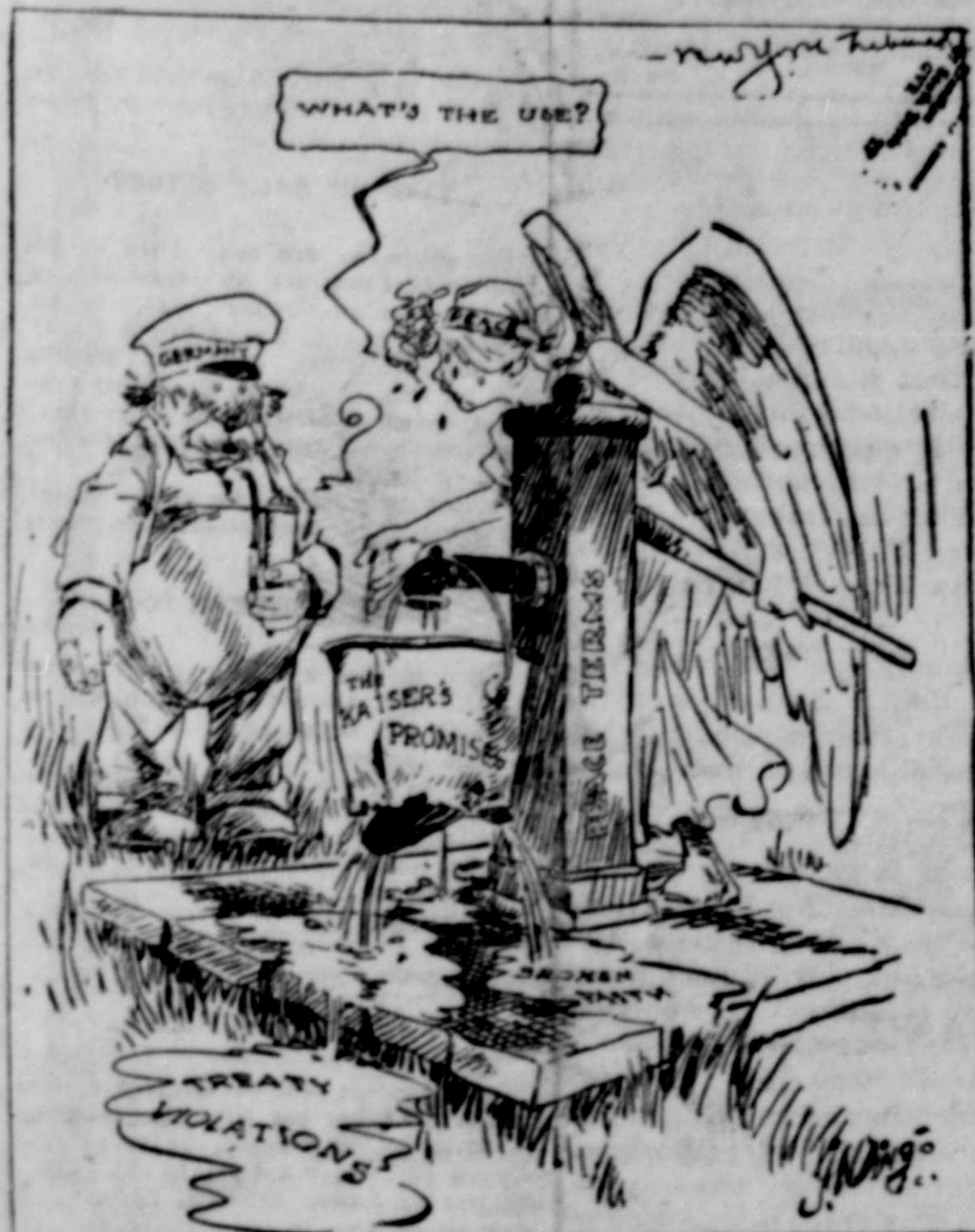
Get Something that will hold water.—New York Tribune.

London, Oct. 2.—The British positions between Tower Hamlets and the Polygon Wood have been heavily bombarded, and the enemy subsequently launched three powerful attacks which were all repulsed. North of the Ypres-Menin road, another strong attack was made by the enemy over a mile front. The German infantry advanced in three distinct waves, and suffered tremendous casualties from the British rifle fire, and the artillery barrage. The first and second waves were mowed down successively, the survivors becoming merged into the third wave of advancing Germans, who finally fled in disorder. Reinforcements were brought up and the German High Command twice renewed the attack, which were also repulsed.