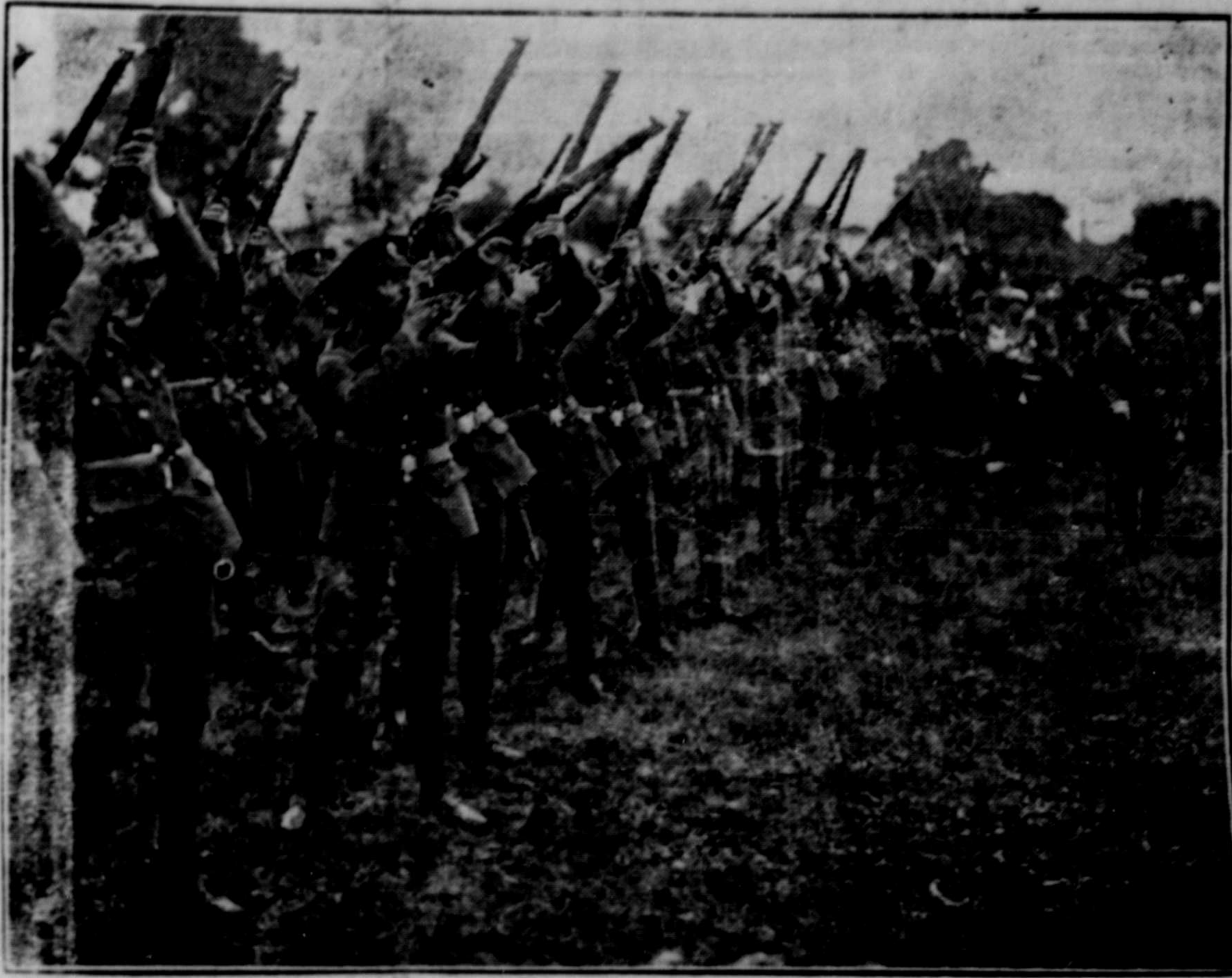
FUNERAL OF HUN RAIDERS IN ENGLAND. —The British continue to pay military honors to the Germans brought down during their air raids. The photograph shows a firing party at the burial of one of the last men, who paid the penalty of carrying out the orders of ruthlessness.

For New Wellington Coal and in Number of all dimensions. Phone 116.