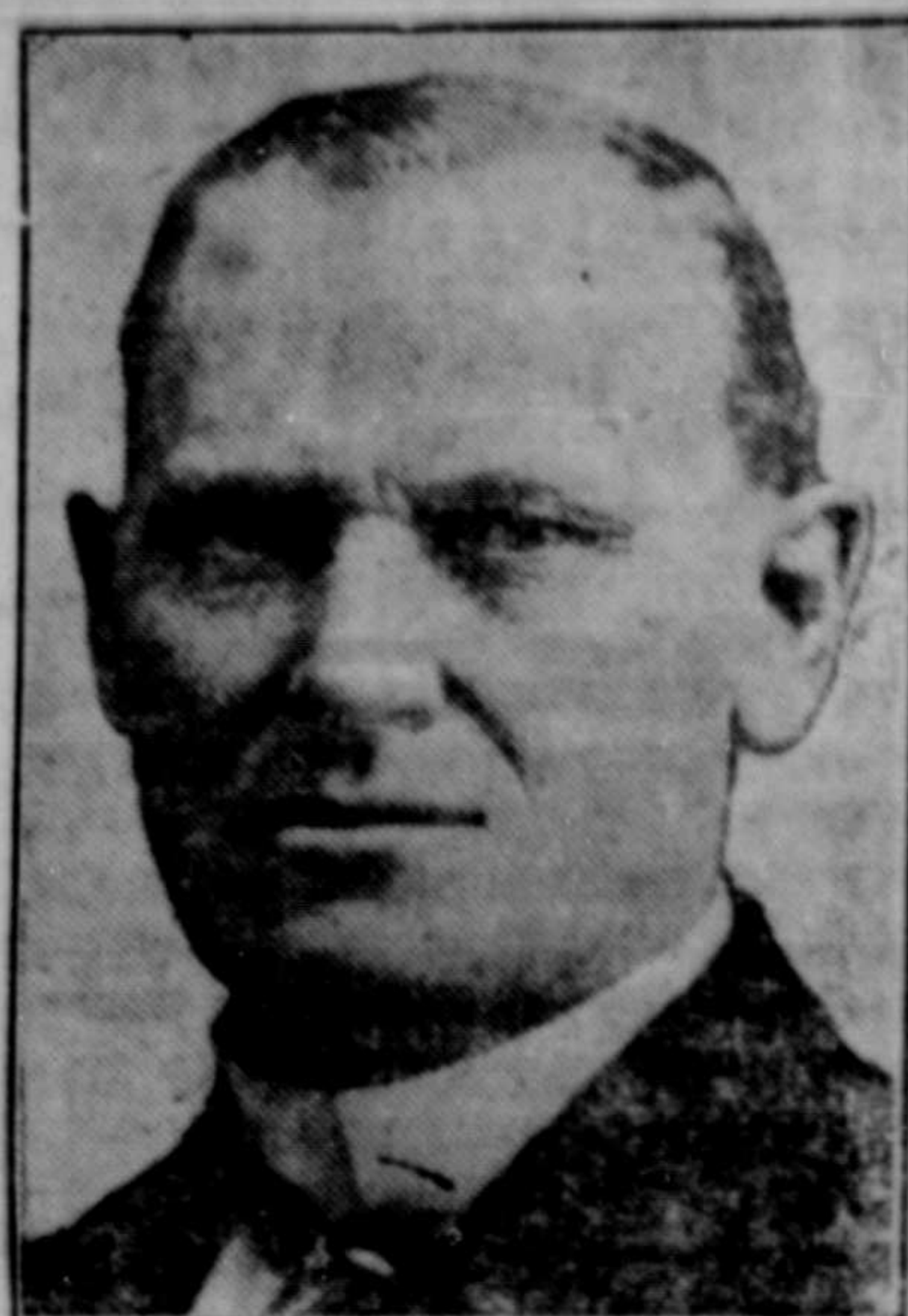
HON. FRANK B. CARVELL Newly appointed Minister of Public Works.

The new government is said to be a War Cabinet. As a war measure, the cutting of the red tape which has tied up the wheels at Hays Creek would be a very popular one.