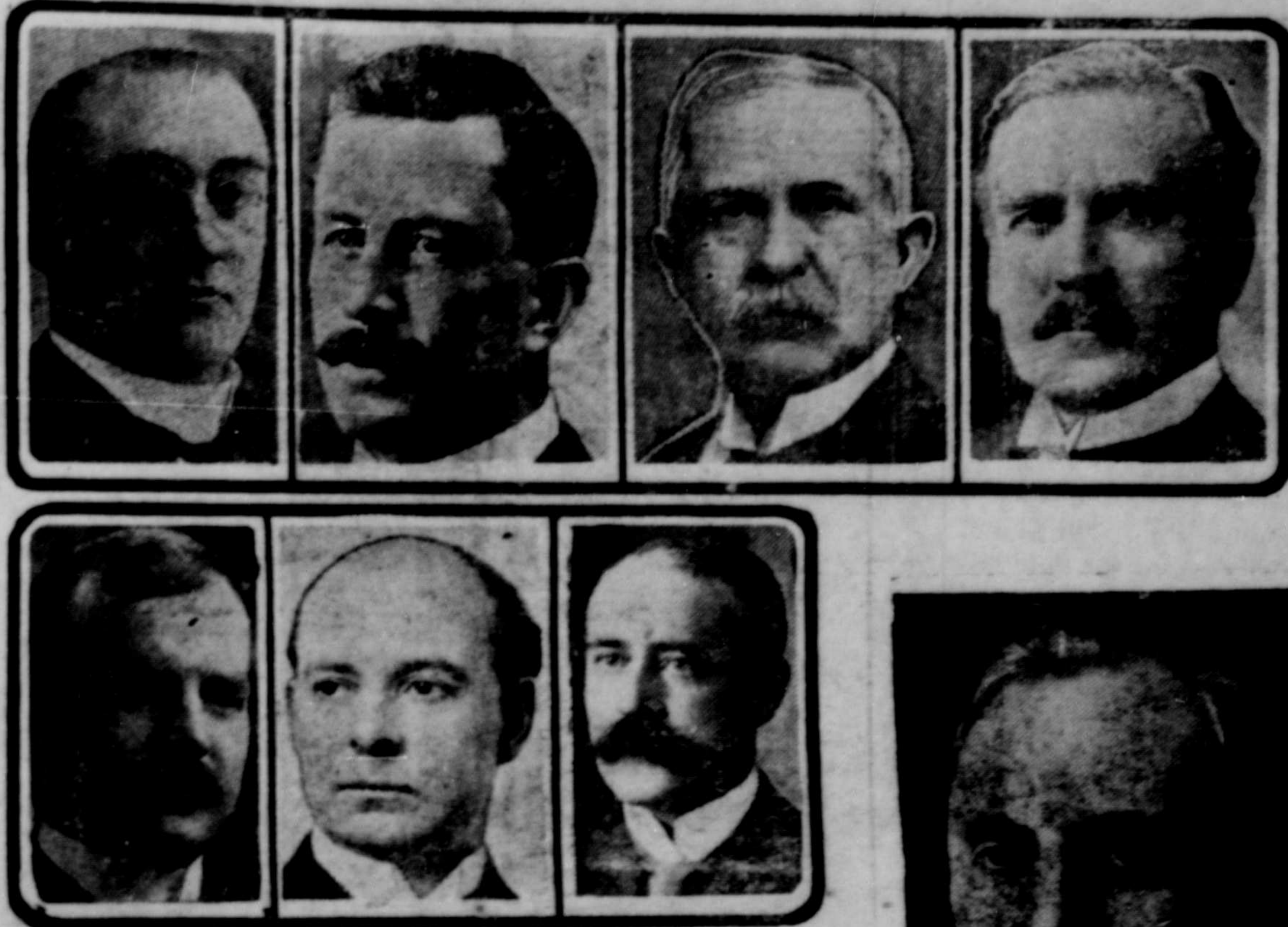
SOME OF THE MEMBERS OF THE NEW UNION CABINET

The favorite household Coal is Ladysmith Wellington. Phone 15. Prince Rupert Coal Co.