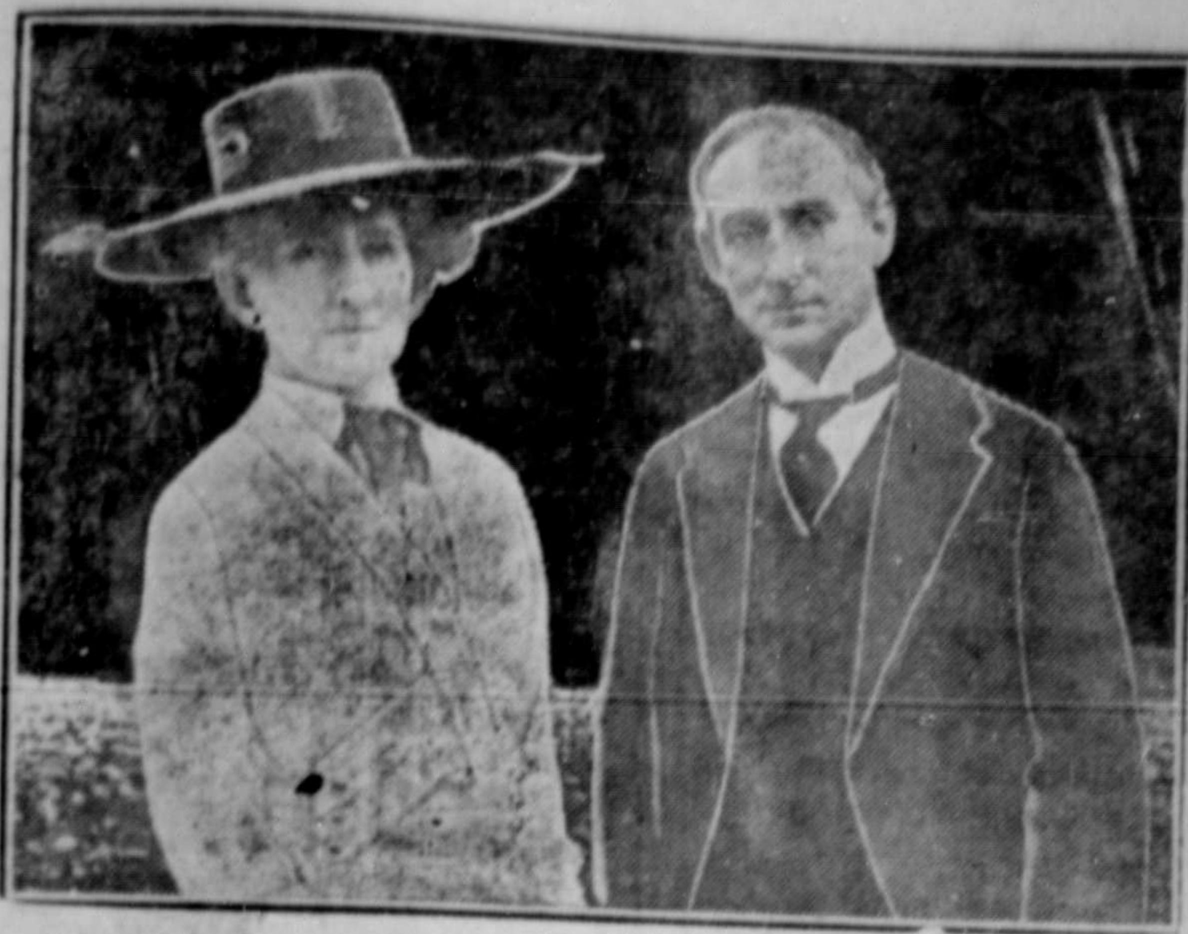
LATEST PHOTO OF LORD AND LADY READING

Lord Reading, who is the Lord Chief Justice of England, is in America on a special mission for Great Britain, in connection with the financing of the war. Regarded as possessing one of the greatest financial minds in the British Empire, he has made several trips to the United States and Canada during the war to arrange for the financing of the Allies.