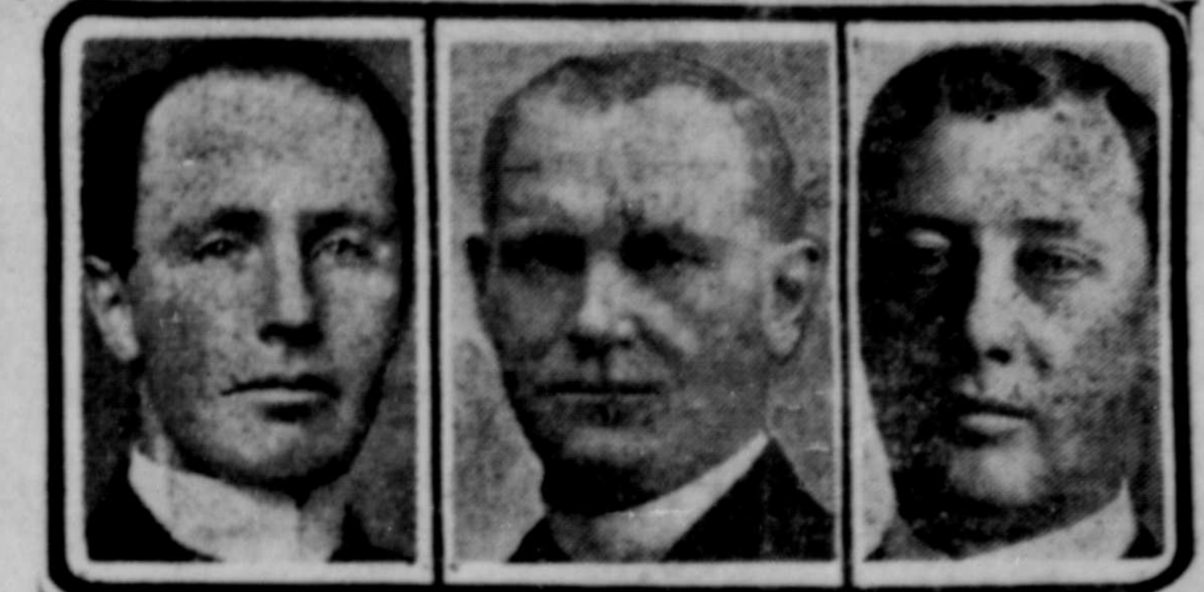
SOME OF THE MEMBERS OF THE NEW UNION CABINET

In the upper row are the Hon. A. L. Sifton, Sir James Lougheed, Hon. J. D. Reid, Major Mewburn. Lower row, the Hon. A. Meighen, Mr. F. B. Carvell, and the Hon. C. C. Ballantyne.