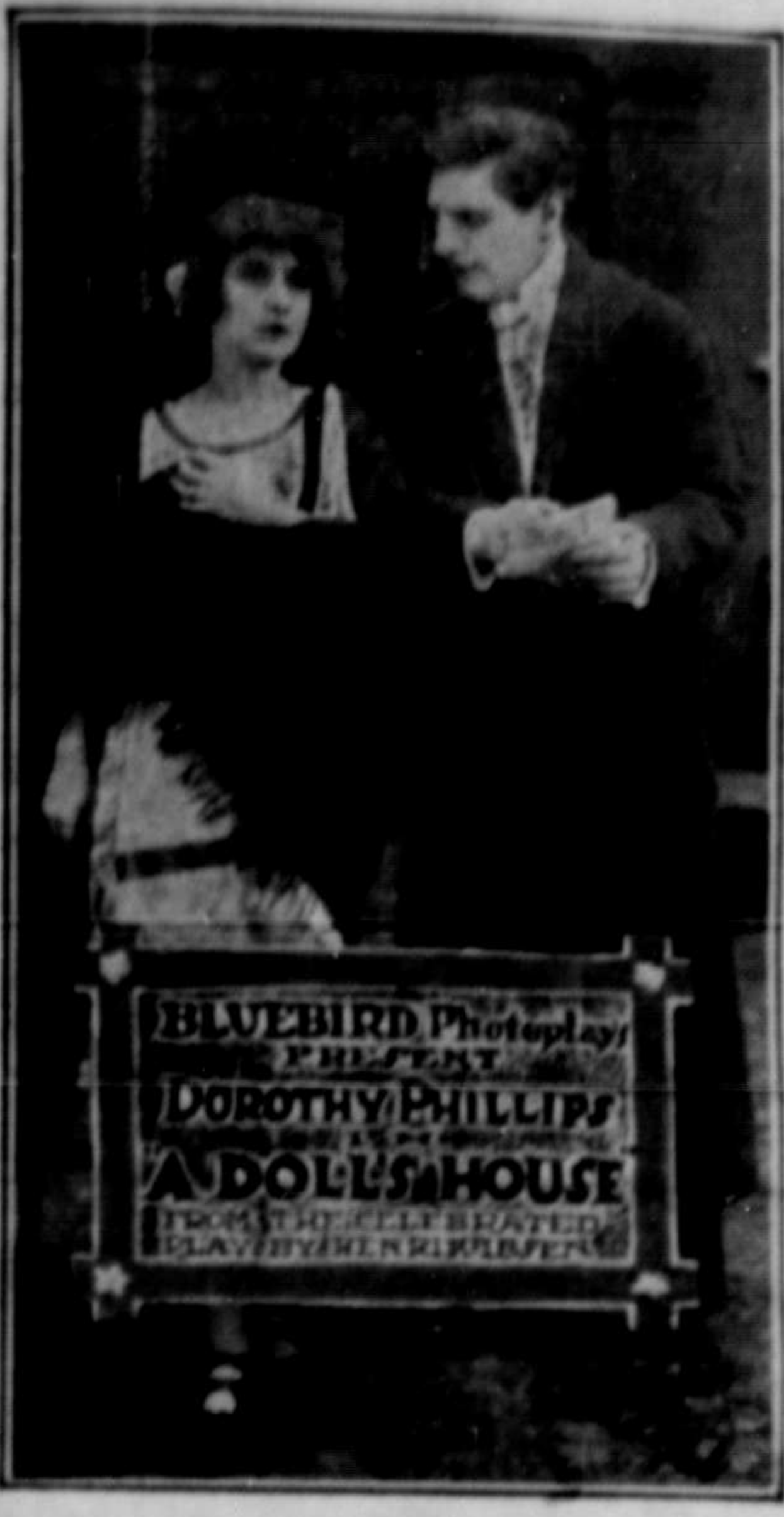
Showing at the Westholme tonight