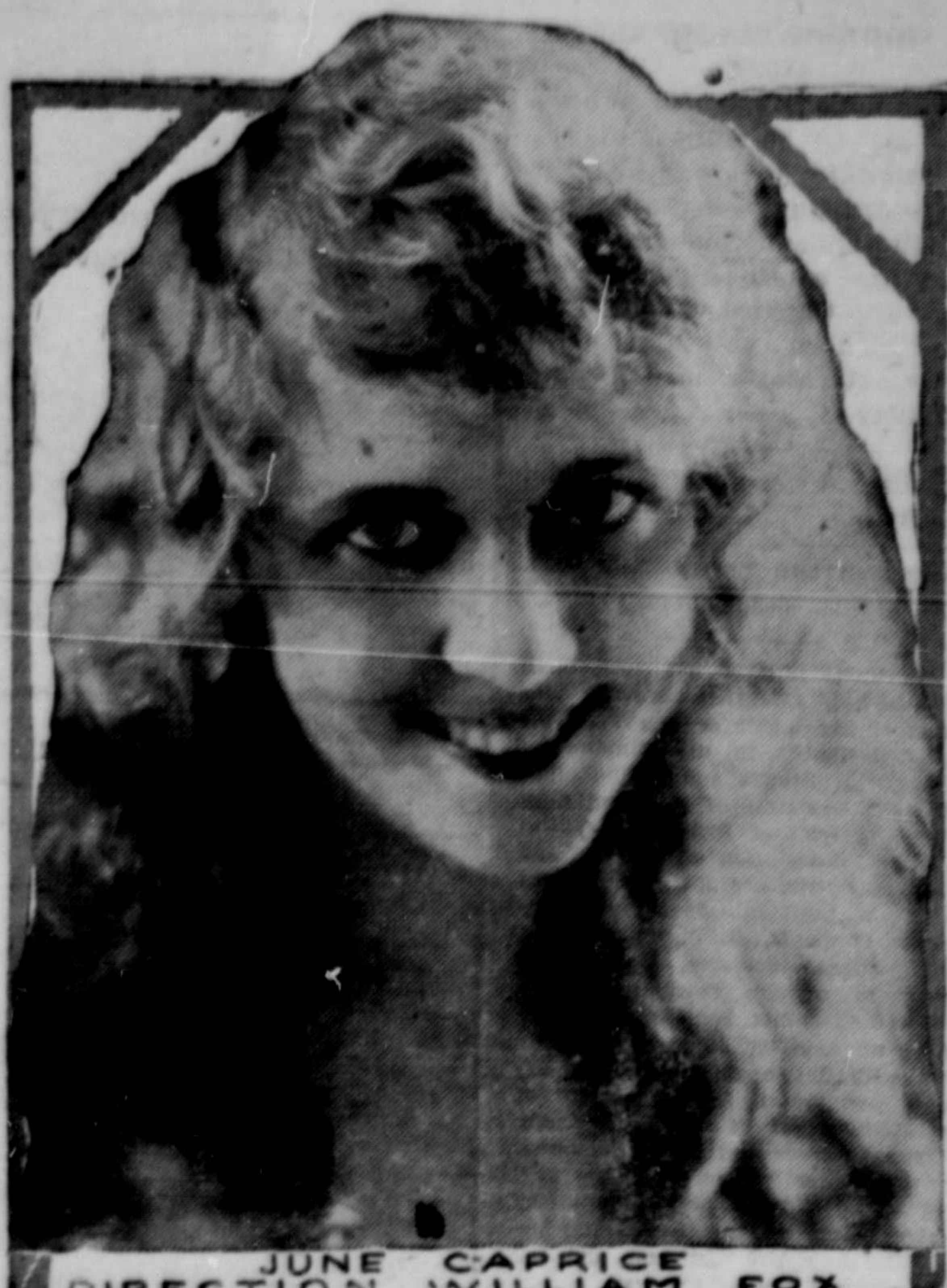
JUNE CAPRICE DIRECTION WILLIAM FOX

Showing at the Westholme Theatre tonight.