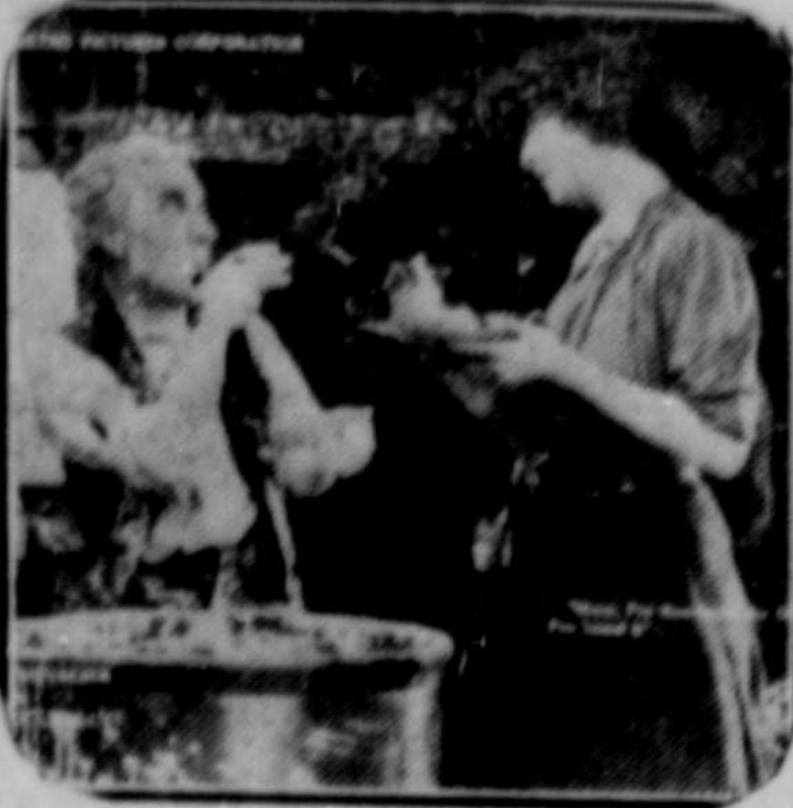
Scene from "Middle Man" Showing at the Westholme tonight

"FRUIT-A-TIVES" is the only medicine in the world that is made from the juices of fresh ripe fruits. Thus, it is manifestly unfair to say, "I won't take Fruit-a-tives because I have tried other remedies and they did me no good". On the other hand, the fact that "Fruit-a-tives" is entirely different from any other preparation in the world, is just why you should give it a fair trial. In any trouble of the Stomach, Liver, Bowels, Kidneys or Skin. "Fruit-a-tives" is composed of the active principle of fruit and the greatest nerve tonic ever discovered. 50c. a box, 6 for $2.50, trial size, 25c. At all dealers or sent postpaid by Fruit-a-tives Limited, Ottawa.