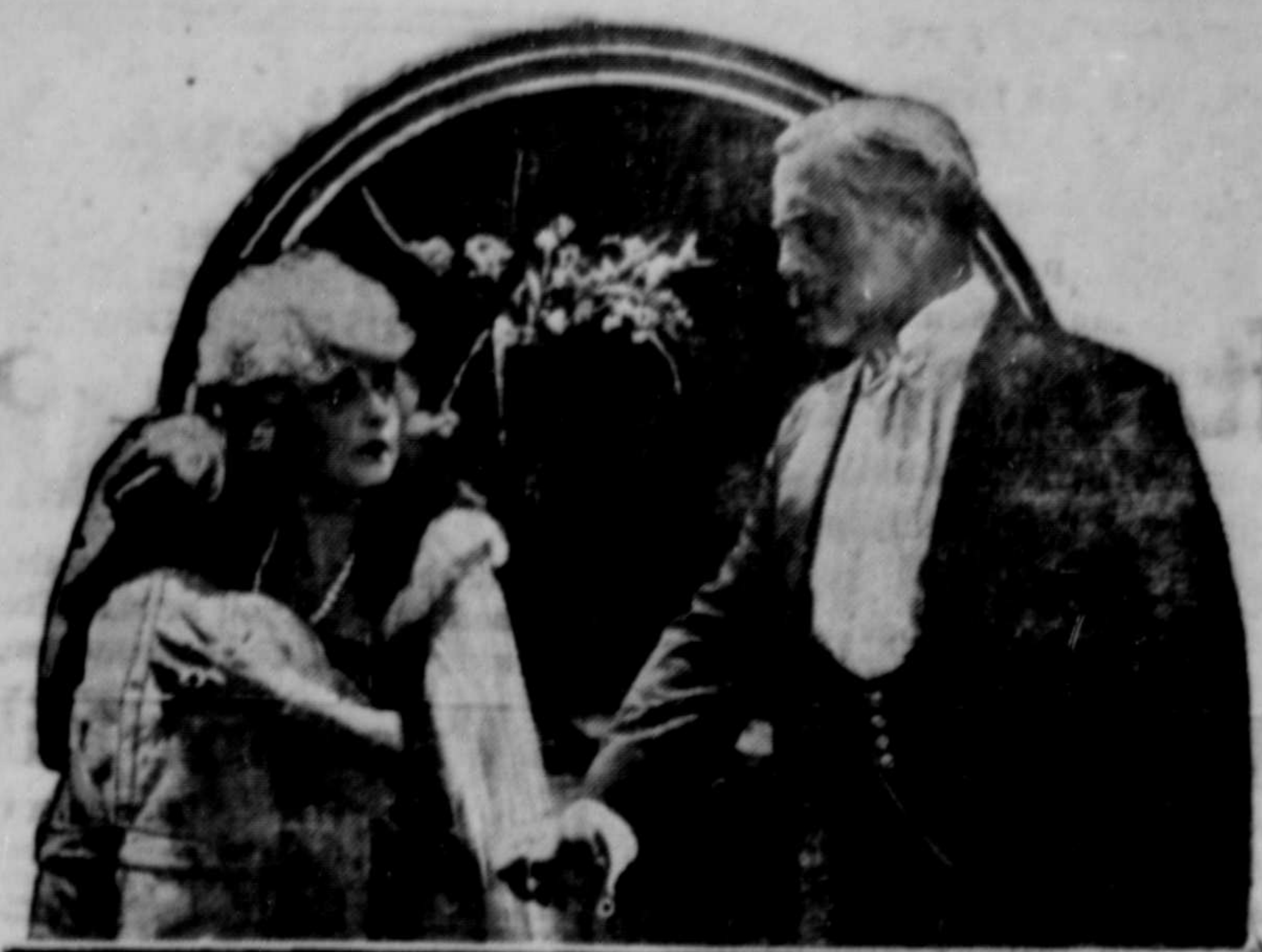
FANNIE WARD in "UNCONQUERED" LASKY-PARAMOUNT. Showing at the Westholme Theatre tonight.