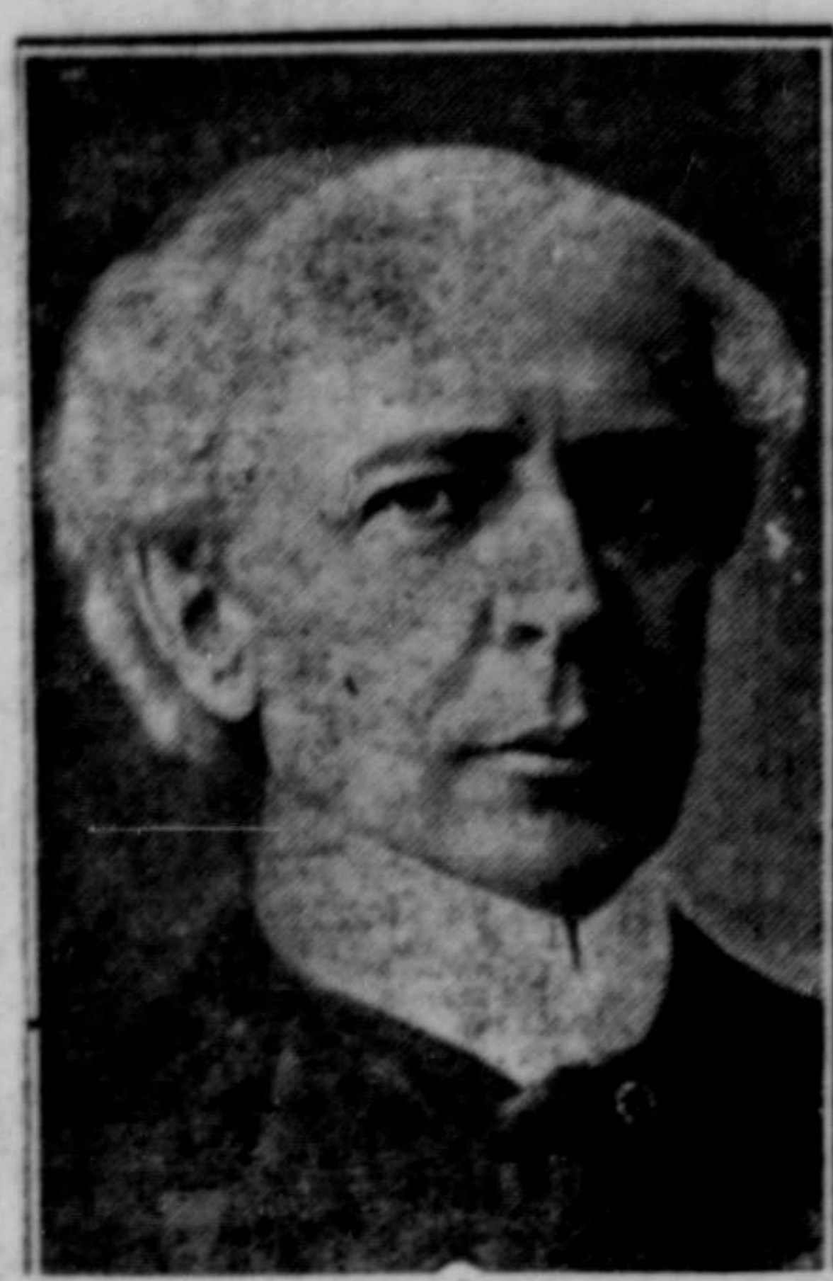
SIR WILFRID LAURIER

"The prices of all commodities have been steadily rising since