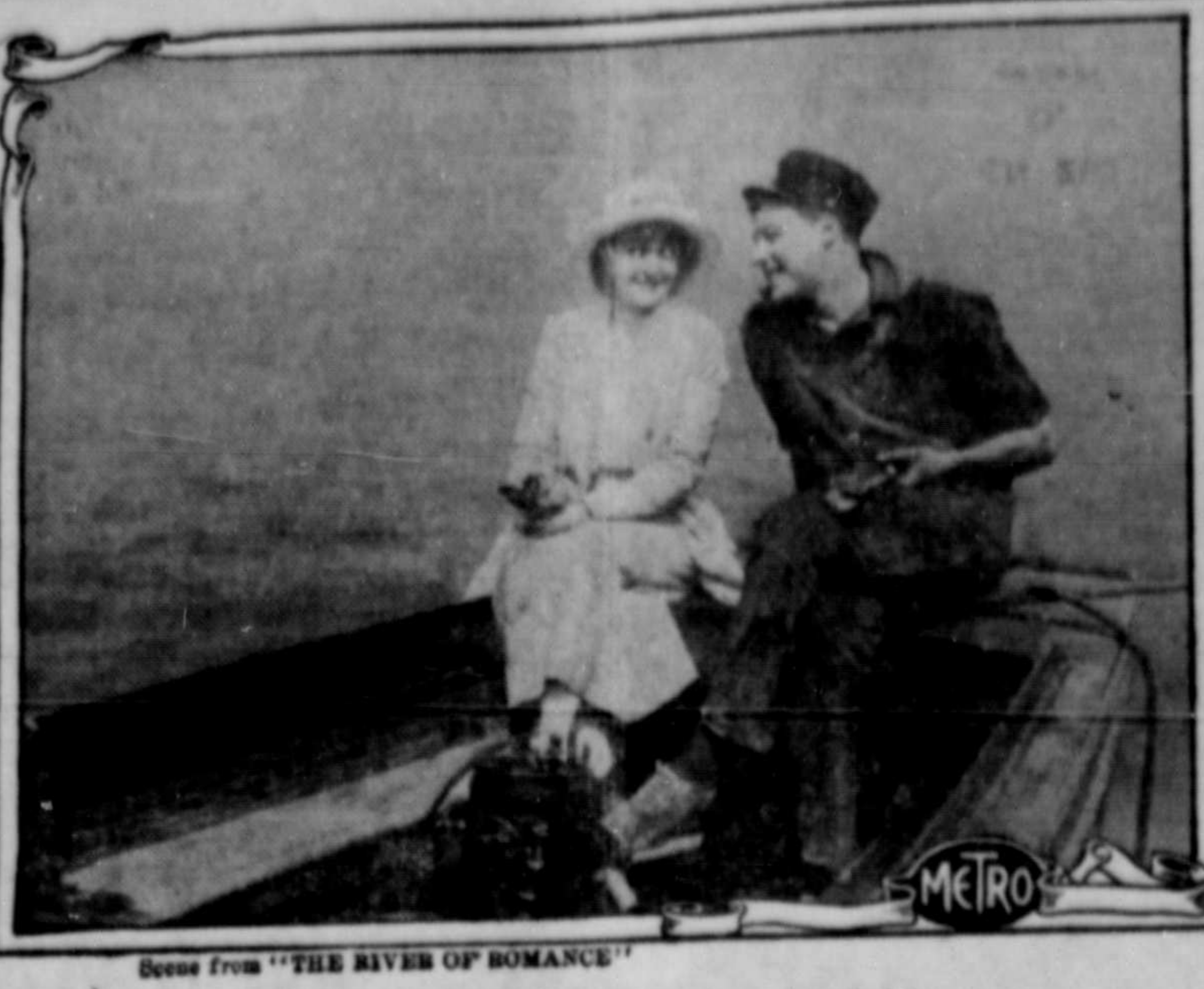
Scene from "THE RIVER OF ROMANCE" Showing at the Westholme Theatre tonight.