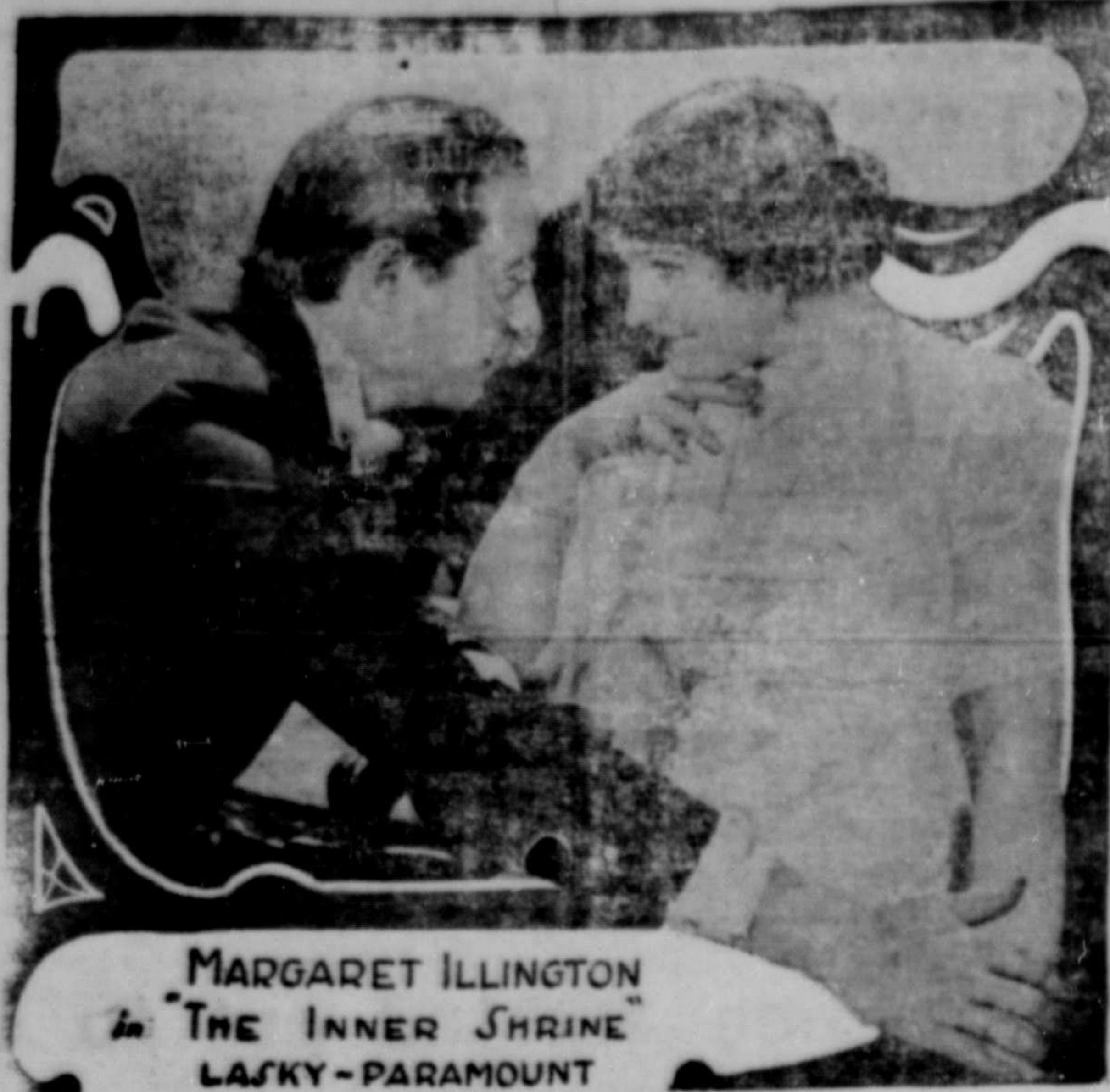
MARGARET ILLINGTON in "THE INNER SHRINE" LASKY-PARAMOUNT

Showing at the Westholme Theatre tonight.