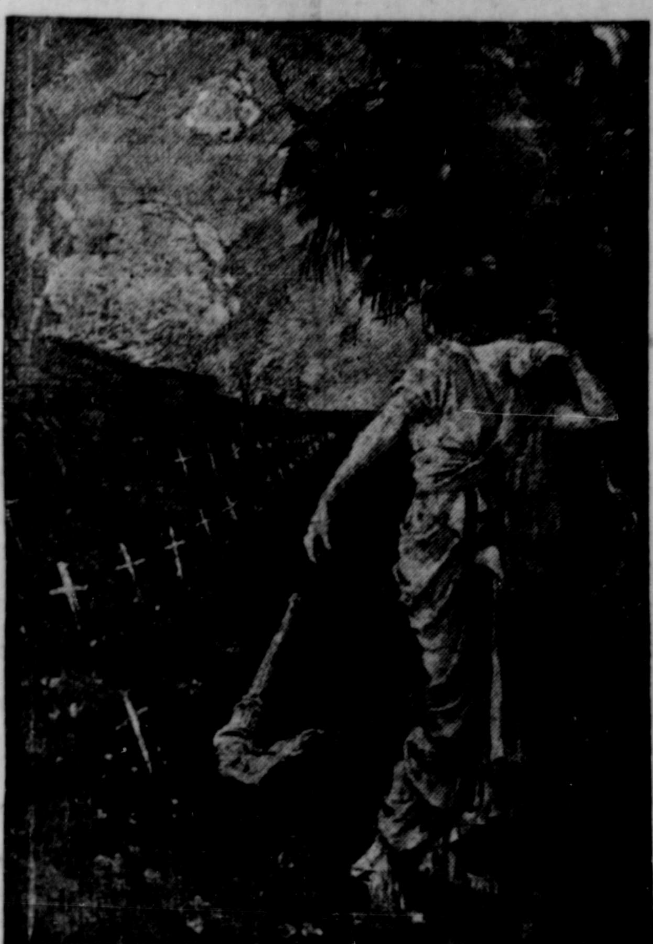
Drawn by R. E. JOHNSON, AND PUBLISHED BY THE COURTESY OF "SATURDAY NIGHT," TORONTO

The great allied council of war will meet today in Paris. Fifty-four statesmen and military and naval experts will meet in conference.