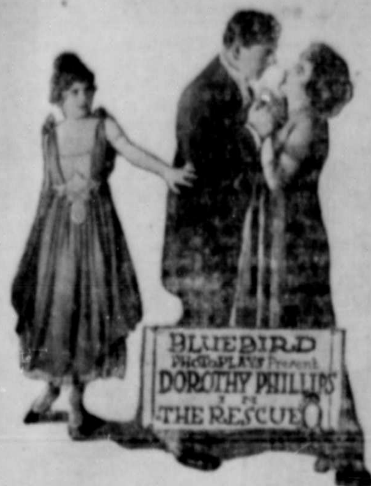
Showing at the Westholme Theatre tonight.