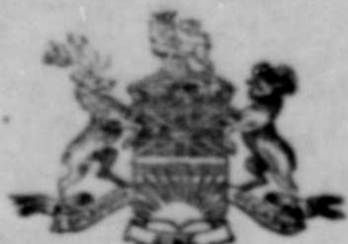
TIMBER SALE X 979.