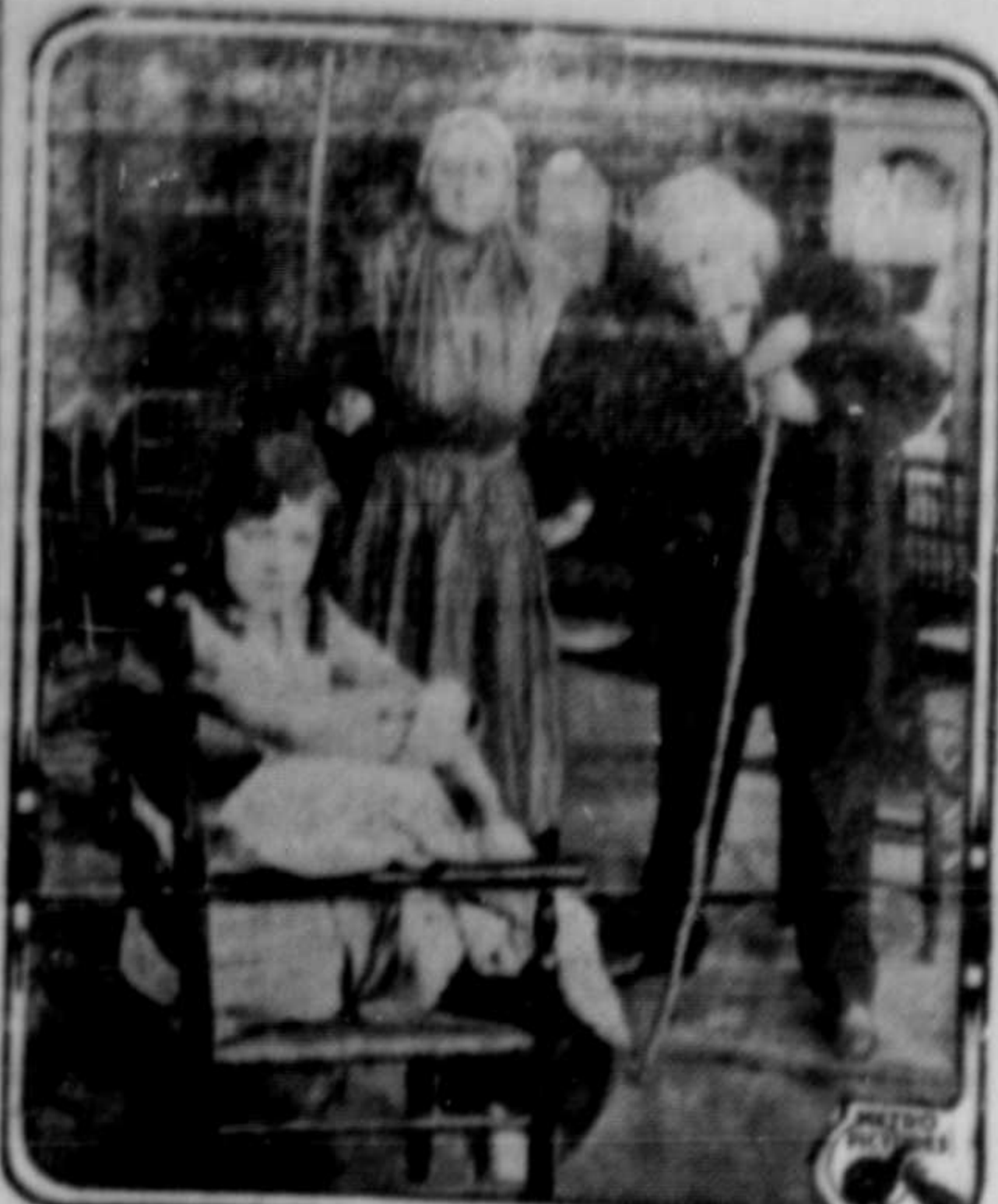
SCENE FROM "THE GATES OF EDEN"

30c. a box, 6 for $2.50, trial size 25c. At all dealers or sent postpaid on receipt of price by Fruit-a-lives Limited, Ottawa.