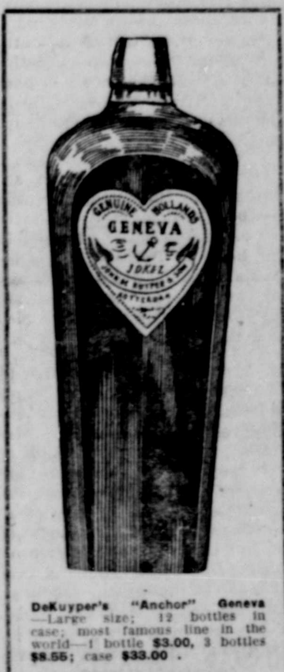
DeKuyper's "Anchor" Geneva ---Large size; 12 bottles in case; most famous line in the world---1 bottle $3.00, 3 bottles $8.55, case $33.00.