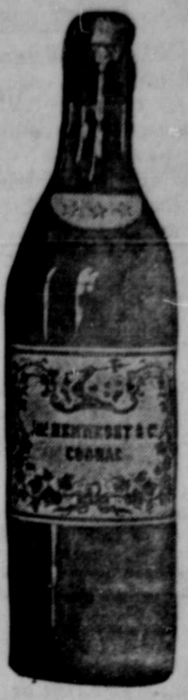
Hennessy's Three Star Cognac---1 bot. $4.00 3 bottles $11.55, case of 12 bottles $45.00.