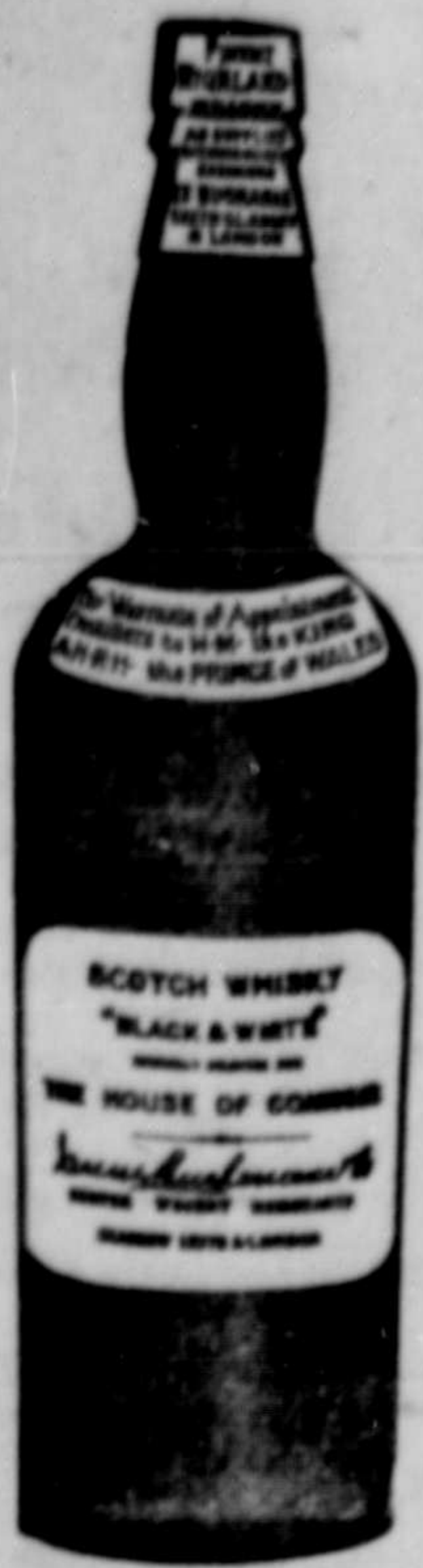
"Black and White"---Buchanan's most popular line in the world; wonderful flavor and quality --- 1 bot $3.75, case $32.50.

We never substitute We give full measure We give full count