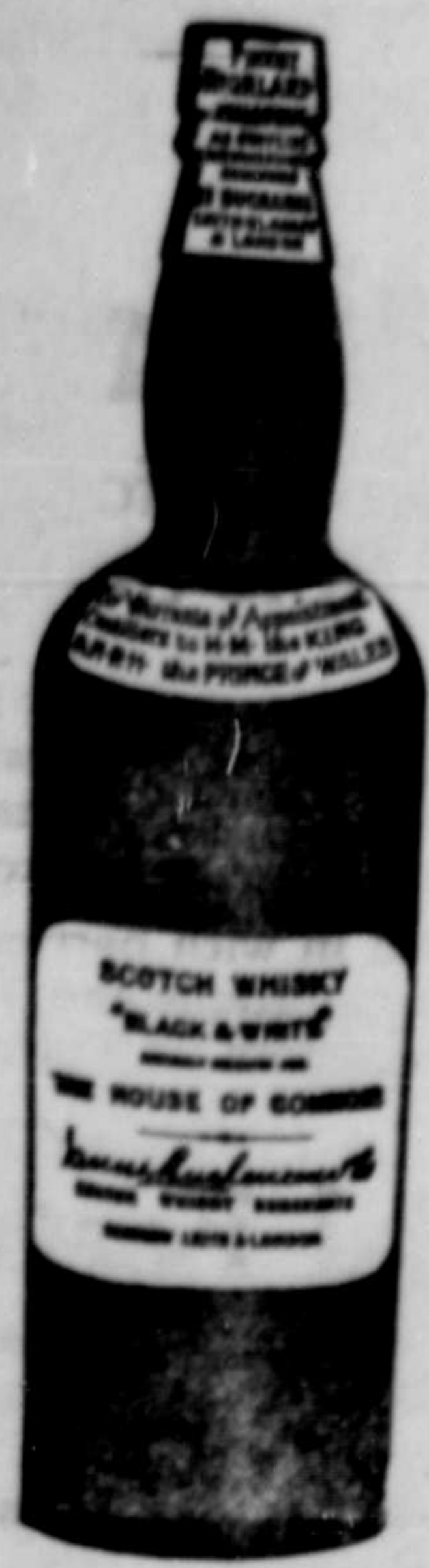
"Black and White"—Buchanan's most popular line in the world; wonderful flavor and quality—1 bot $3.25, case $32.50.

AND FURTHER TAKE NOTICE that action, under section 85, must be commenced before the issue of such Certificate of Improvements. DATED this 26th day of October, A. D. 1917.