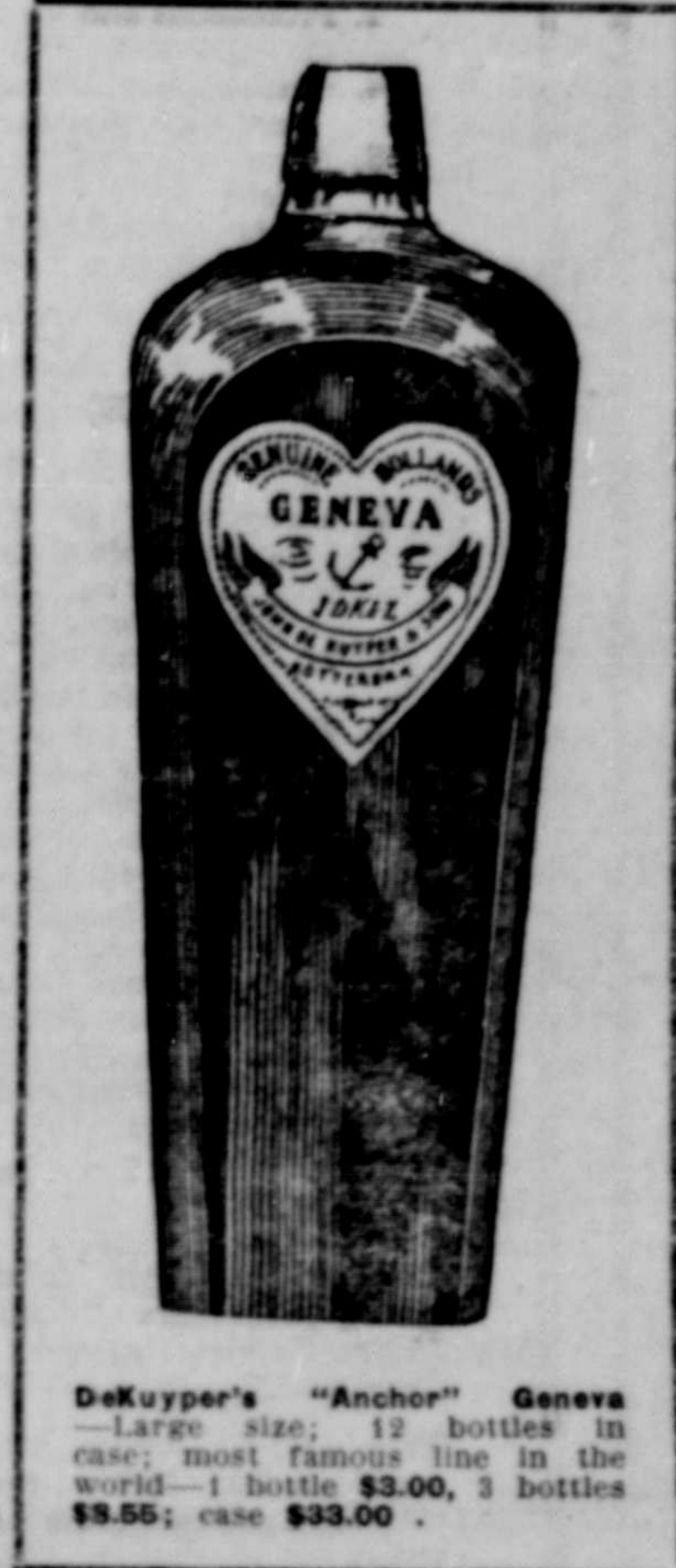
DeKuyper's "Anchor" Geneva—Large size; 12 bottles in case; most famous line in the world—1 bottle $3.00, 3 bottles $9.55; case $33.00.