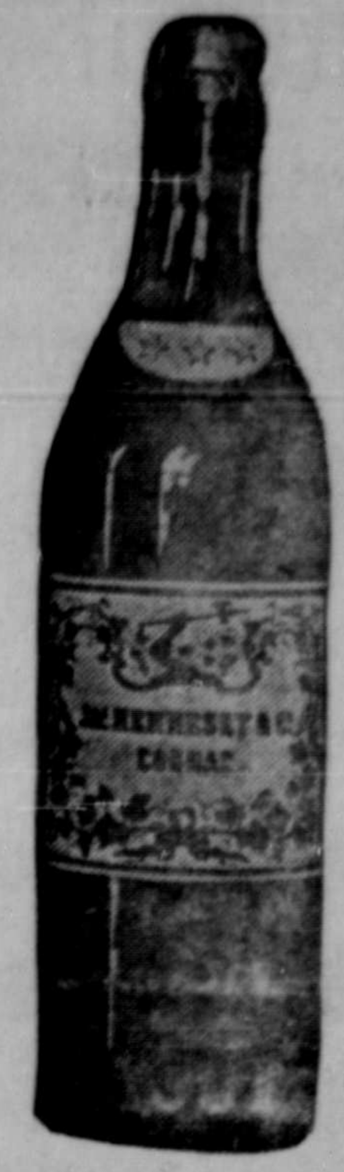
Hennessy's Three Star Cognac—1 bot. $4.00 3 bottles $11.55, case of 12 bottles $45.00.

We never substitute We give full measure We give full count