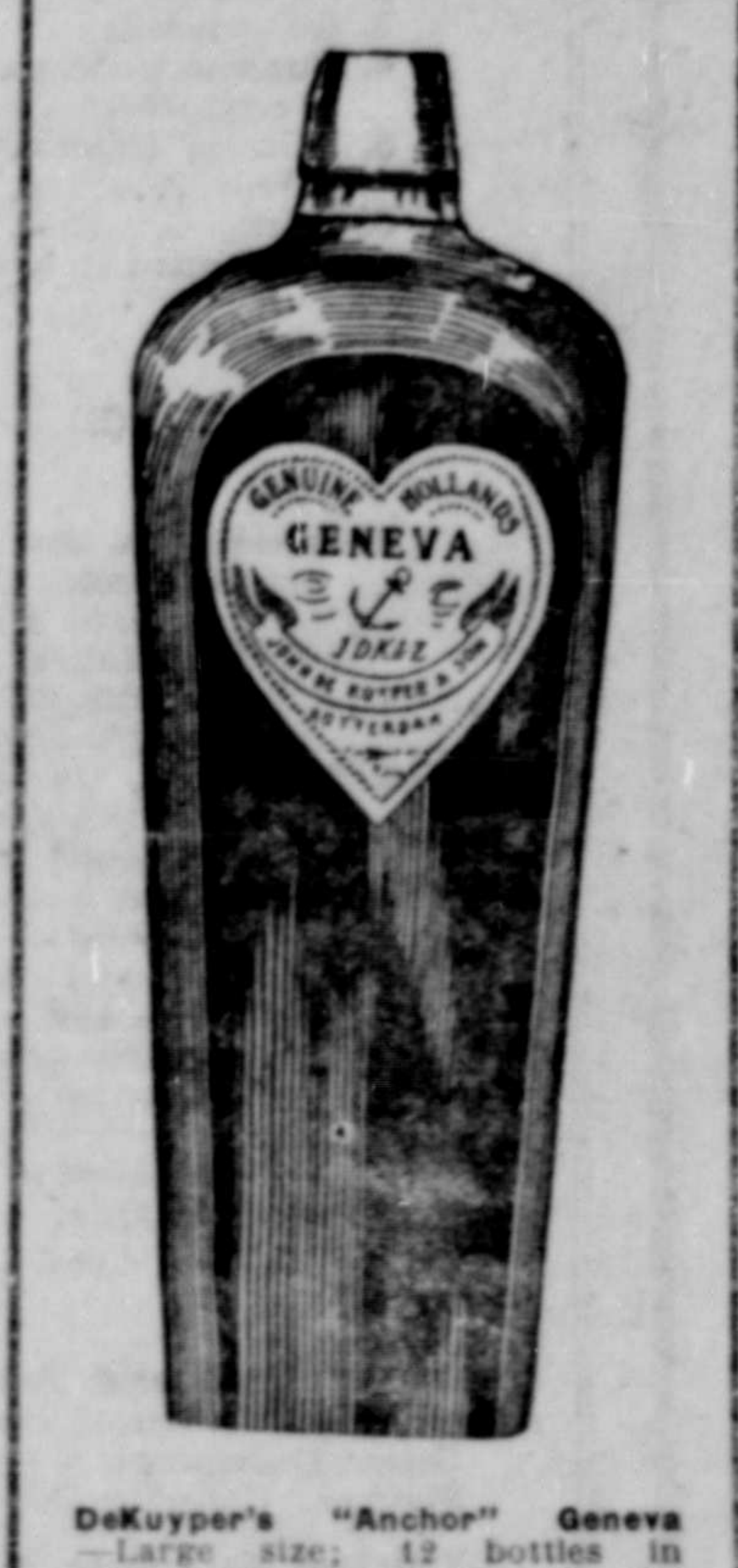
DeKuyper's "Anchor" Geneva—Large size; 12 bottles in case; most famous line in the world—1 bottle $3.00, 3 bottles $8.55; case $33.00.