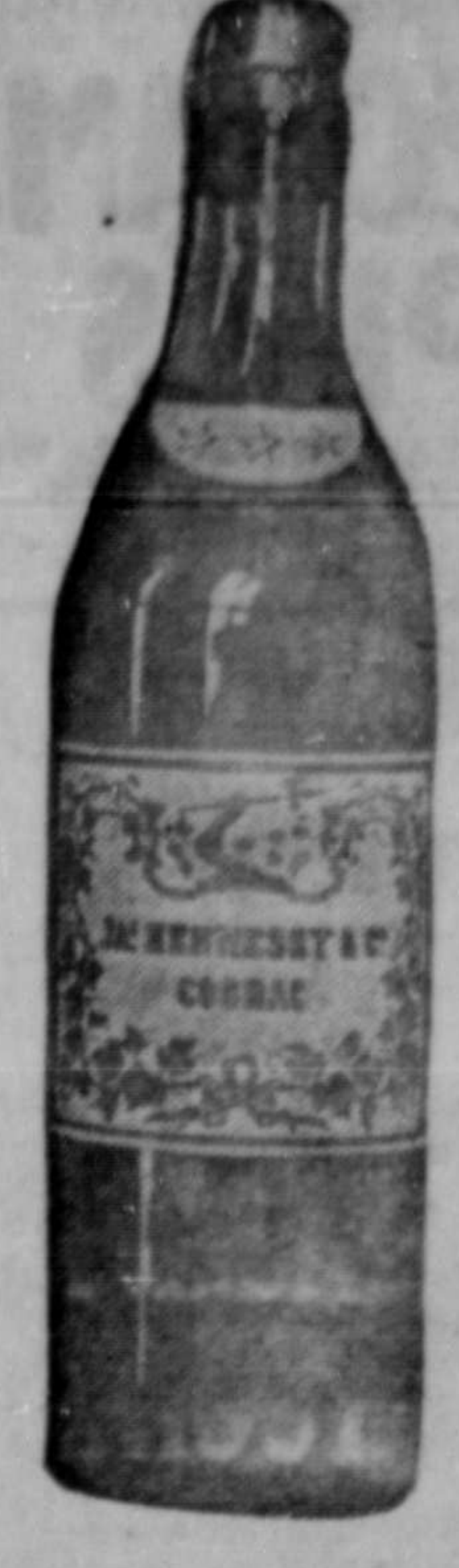
Monnessy's Three Star Cognac—1 bot $4.00 3 bottles $11.55, case of 12 bottles $45.00.

We never substitute We give full measure We give full count