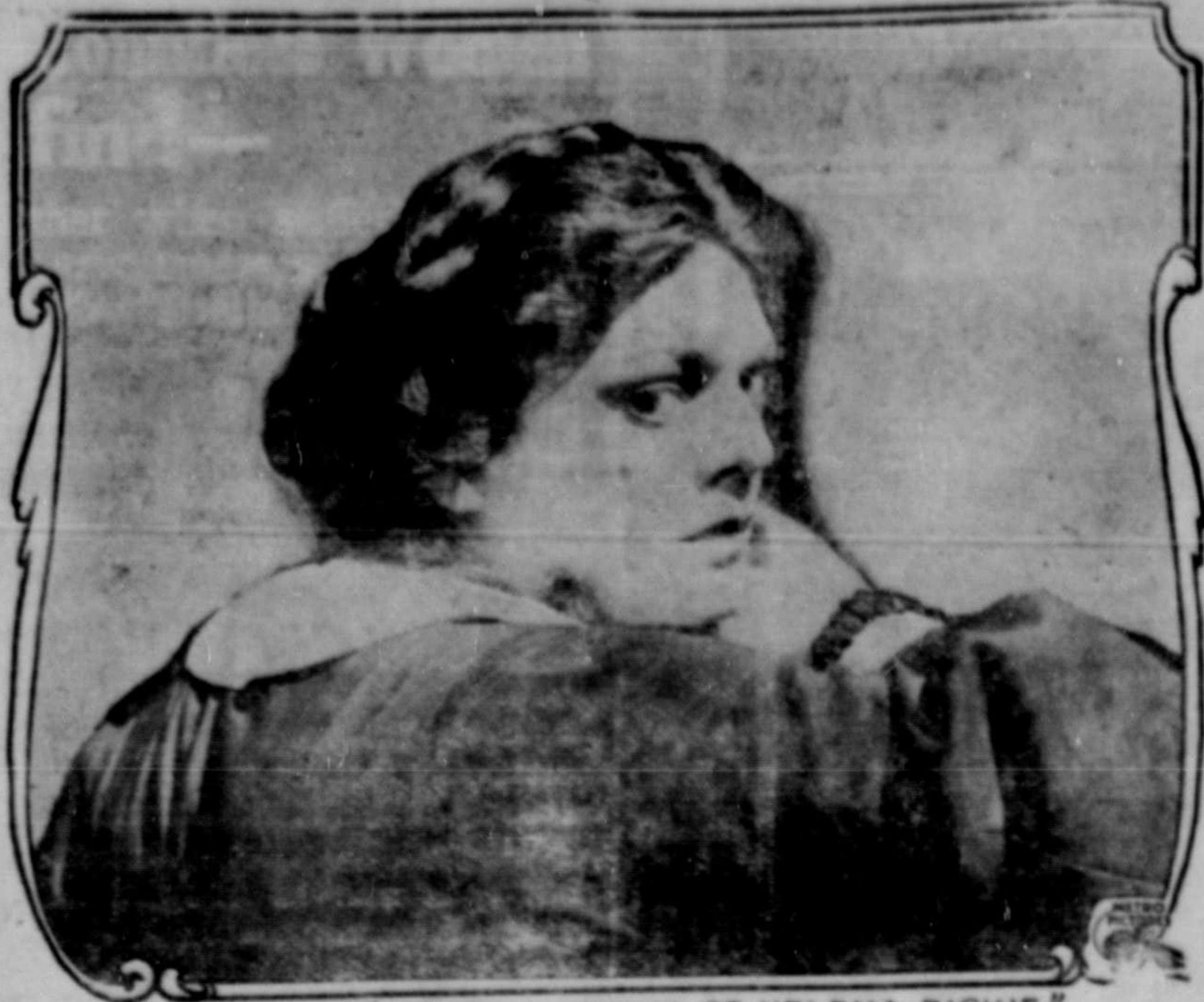
SCENE FROM "THE AWAKENING OF HELENA RICHIE," Showing at the Westholme tonight

Easter Cards and novelties for March 29, at McRae Bros., Ltd. 74