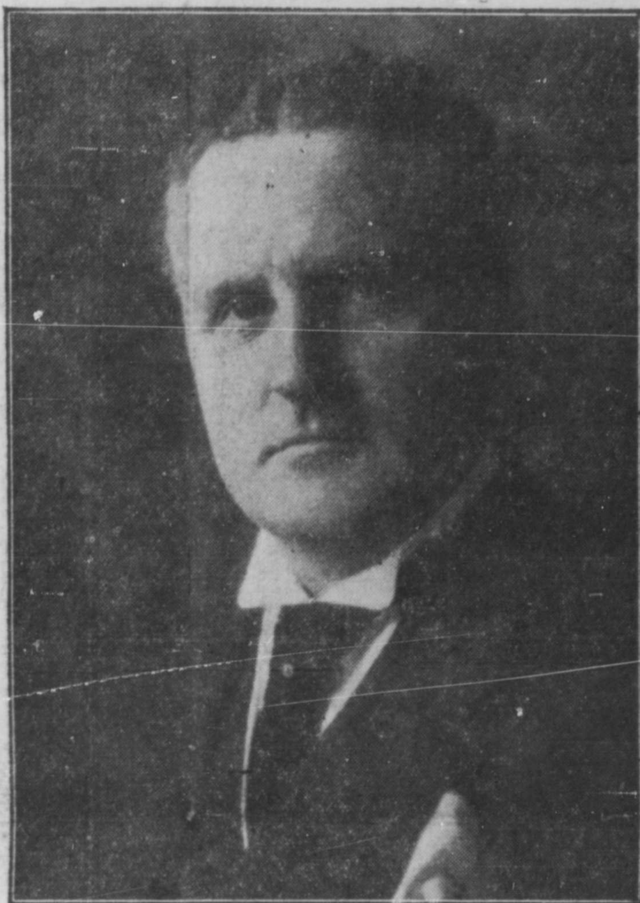
Government must balance budget and also care for people, declares T. D. Pattullo, Liberal leader.