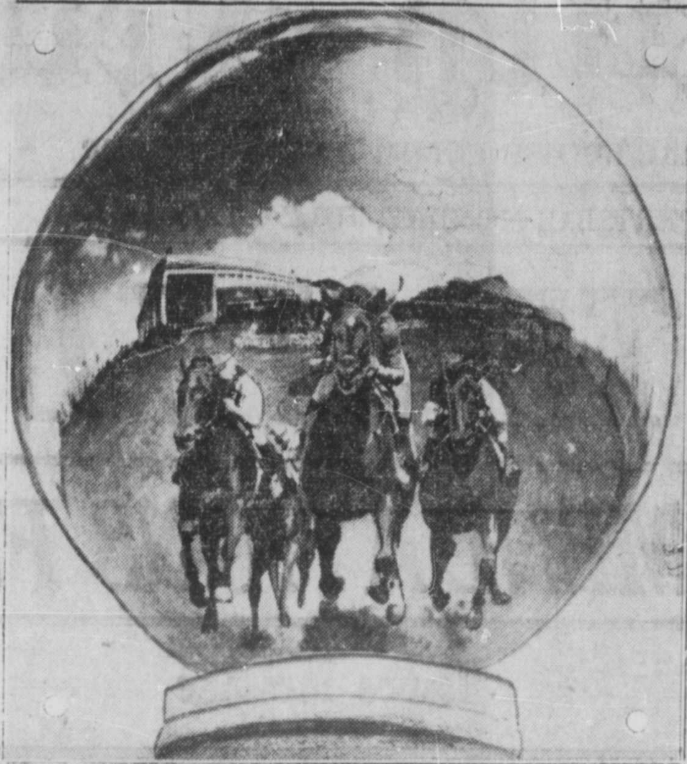
A crystal gazer's dream. This unusual photograph was made at the Chicago race track by holding a camera up to one of the large crystal balls which decorate the grounds.