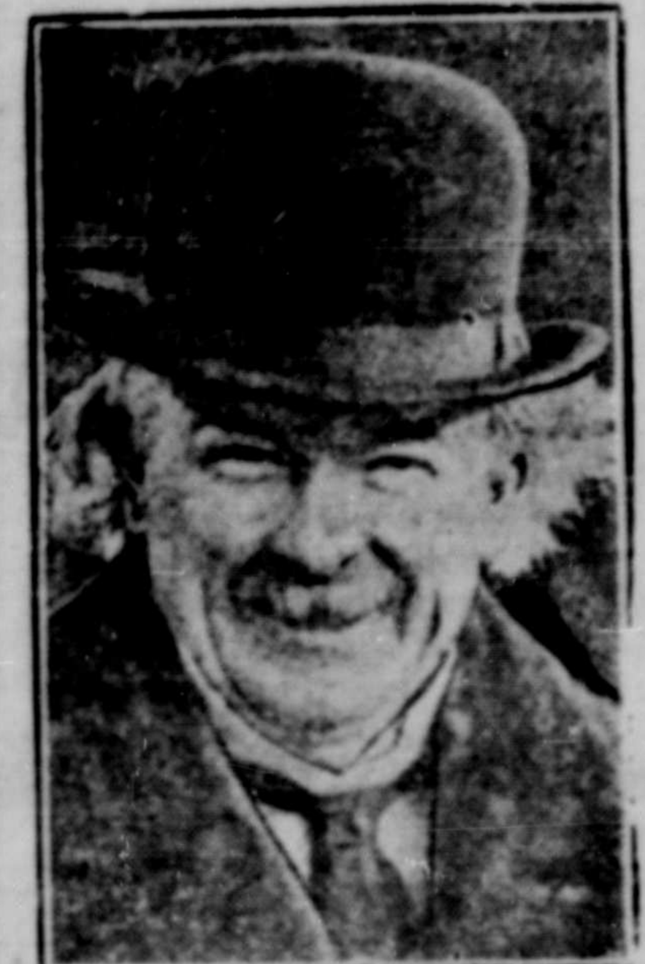
PREMIER LLOYD GEORGE

London, May 10.—The triumph of Premier Lloyd George is certain before a parliament faced by the possibility of his vacating of