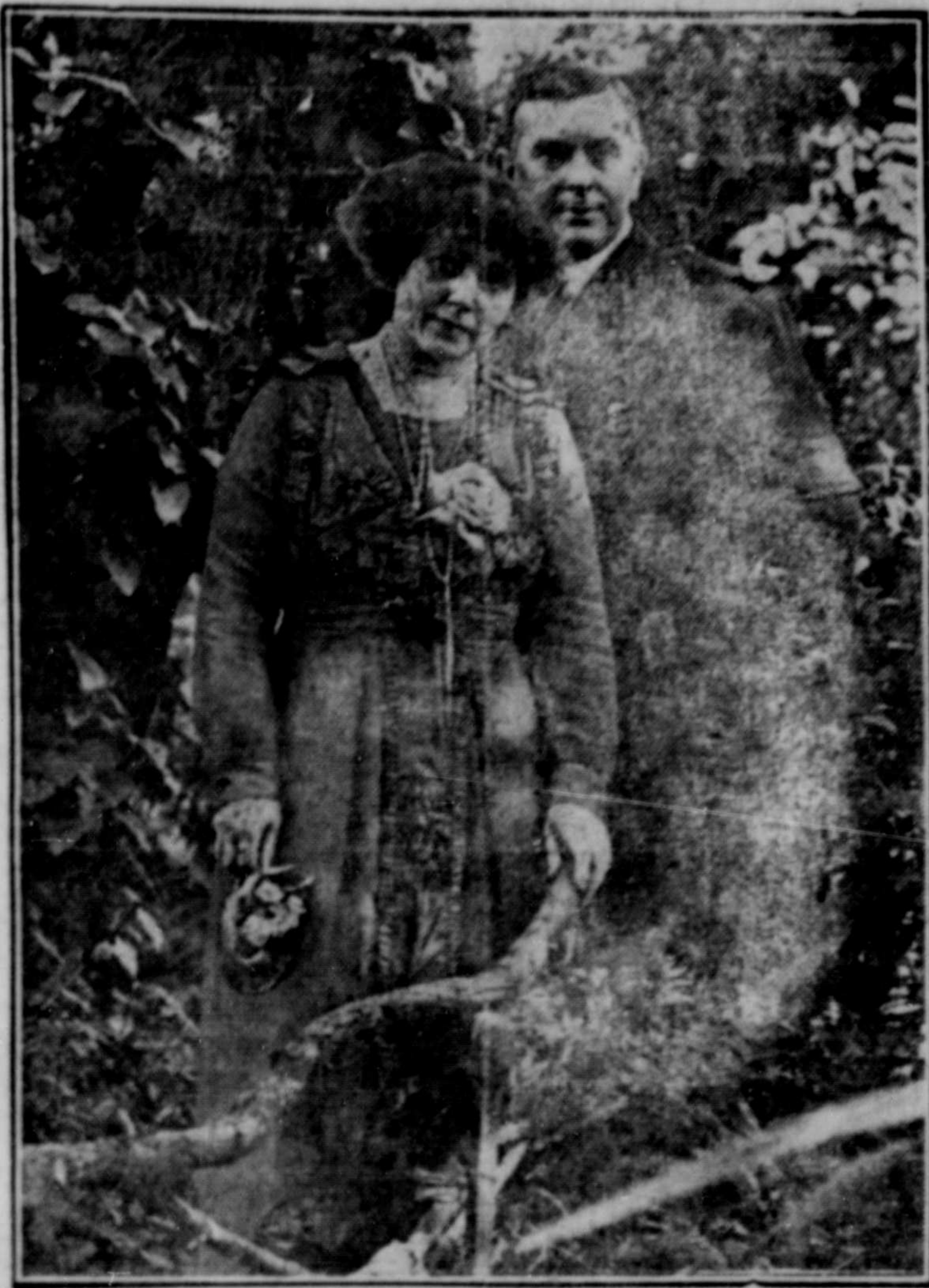
MADAM STEINHEIL MARRIES LORD ABINGER

Dublin, July 31.—No one here knows when the Irish Convention will end, nor what it will bring forth. The Green Isle was never so rich and prosperous as it is now.