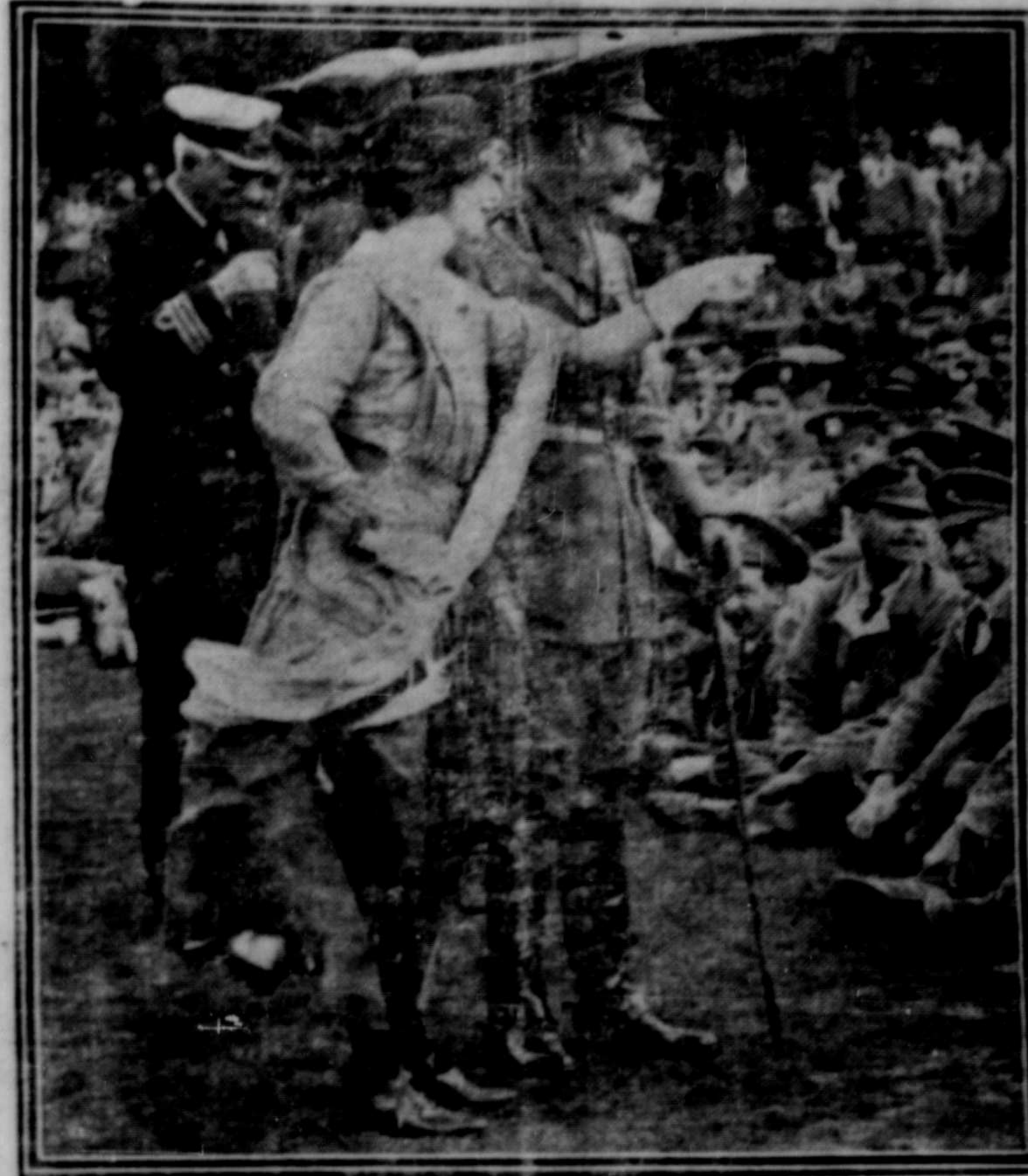
THE KING'S VISIT TO WOUNDED CANADIANS AT TAPLOW This picture shows Mrs. Waldorf Astor acting as guide to His Majesty on the tour of the grounds of the Astor home at Cliveden, which has been turned into a hospital for wounded soldiers.

For New Wellington Coal and Fir Lumber of all dimensions. Phone 116.