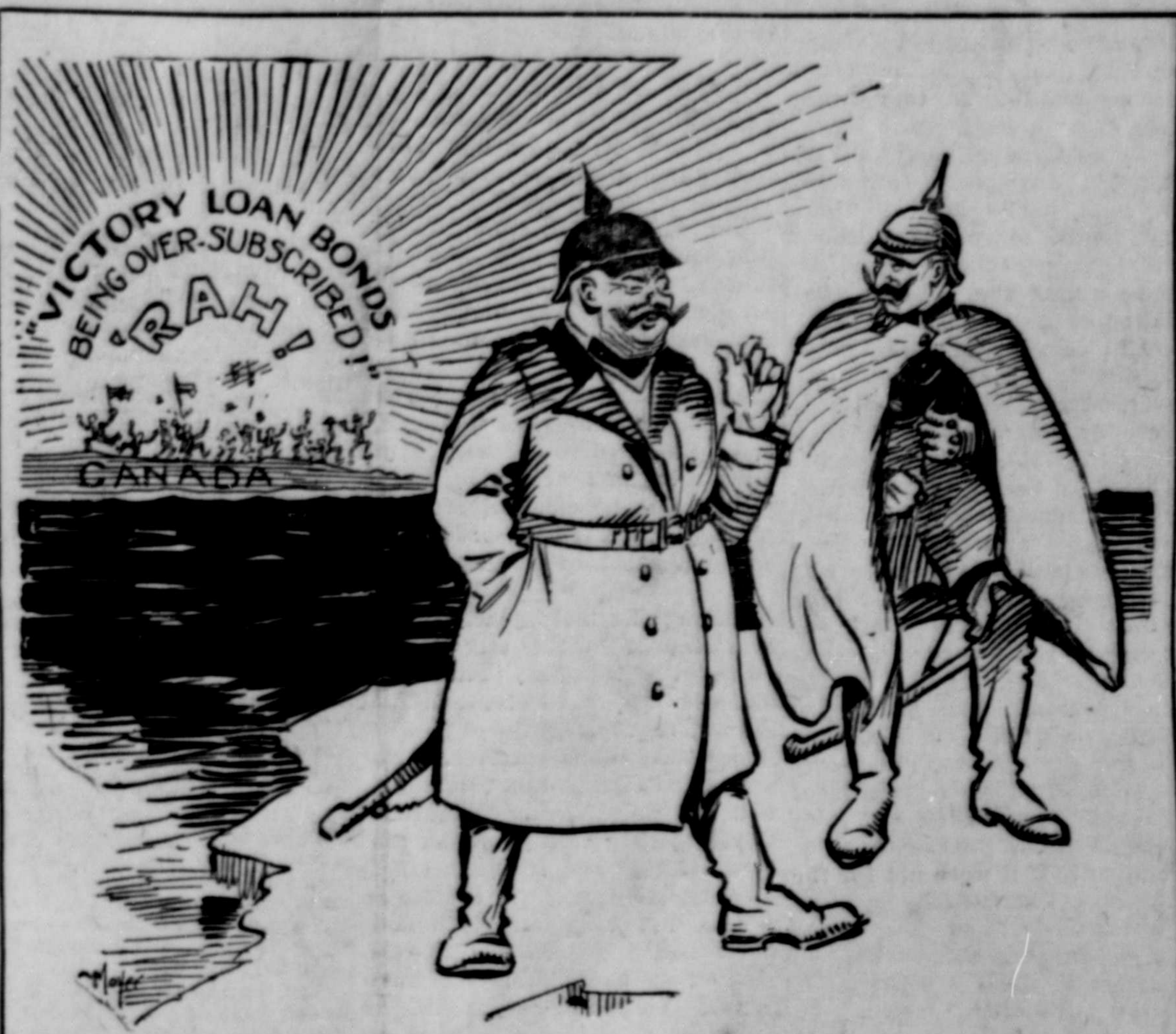
HINDENBURG:—What is that noise in Canada? THE KAISER:—It's the clink of REAL money being loaned for a REAL security! Don't mind admitting I'd feel safer if I had some of those Canadian Victory War Loan Bonds myself.