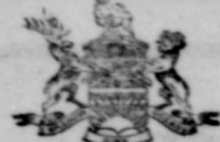
TIMBER SALE X 926.

Sealed tenders will be received by the Minister of Lands not later than noon on the 25th day of February, 1918, for the purchase of Licence X 926, to cut 2,566,000 feet of Hemlock, Spruce, Balsam and Cedar in an area situated on Long Lake, Fraser reach, Range 4, Coast District.