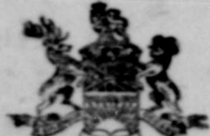
TIMBER SALE X 979.

The play is a great one which shall please everyone. There will also be a splendid comedy and a gazette.