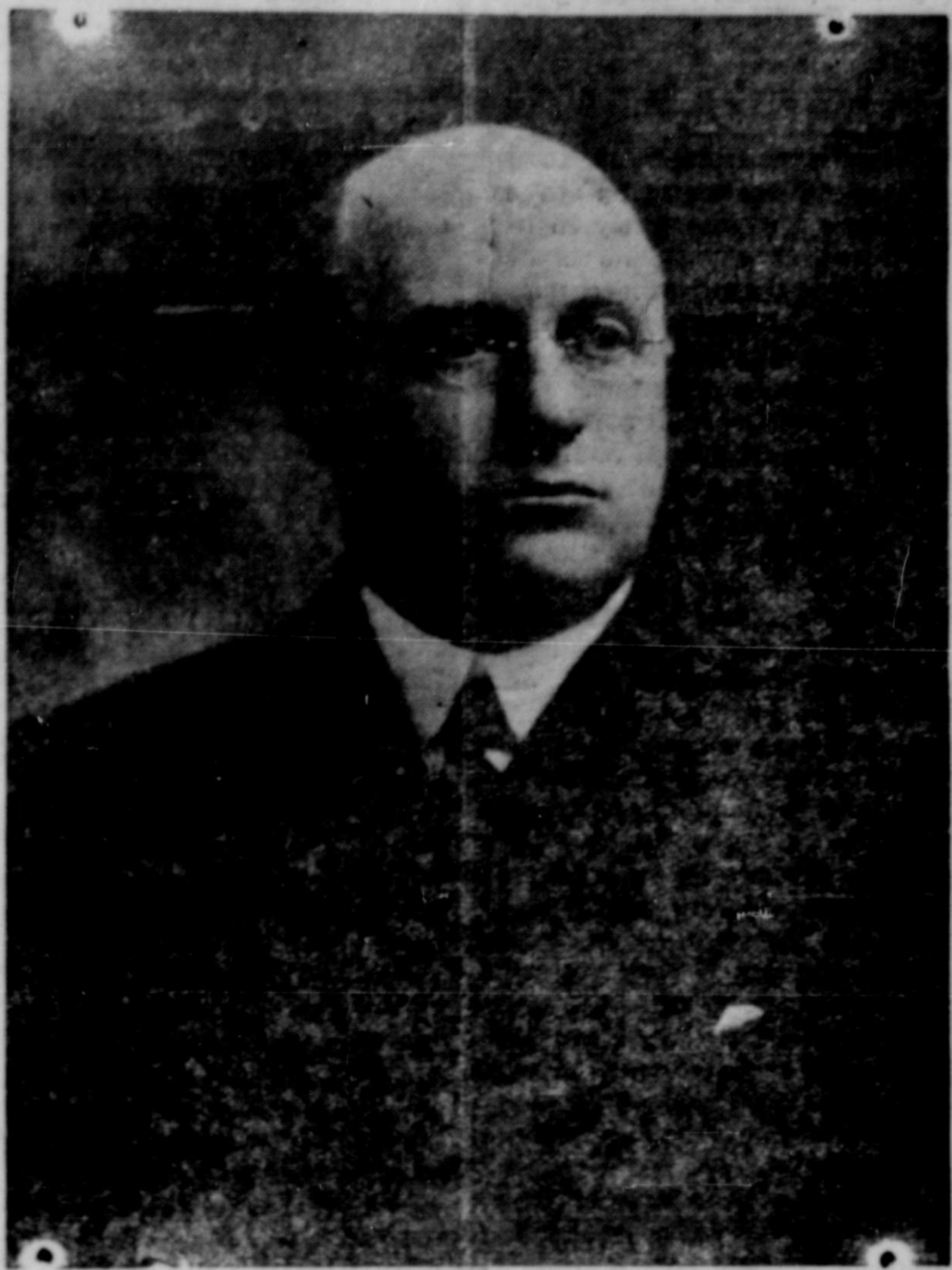
HONORABLE H. C. BREWSTER, PREMIER OF B. C.

PREMIER BREWSTER STRICKEN DOWN Calgary, Feb. 25.—Premier Brewster was suddenly stricken down with pneumonia while the train on which he was speeding to the coast was just east of Calgary. When he arrived here, he was taken from the train and hurried to the hospital.