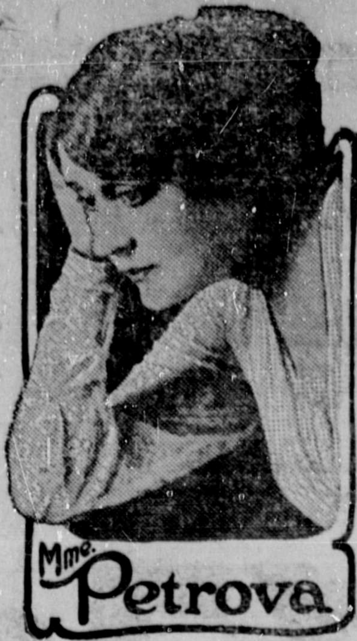
At the Westholme Tonight.

Take a trip to the salt lakes on the launch Alice B. Boat leaves P. R. Boat House for salt lakes every hour commencing 10 a. m. on Sundays and 2 p. m. on Wednesdays. On other week days two trips starting at 6 and 7 p. m. Round trip Sundays, 35c, week days, 50c. Launches, rowboats, and canoes for hire at all times. Gov't. Wharf, phone Red 394. P. R. Boat House. 11