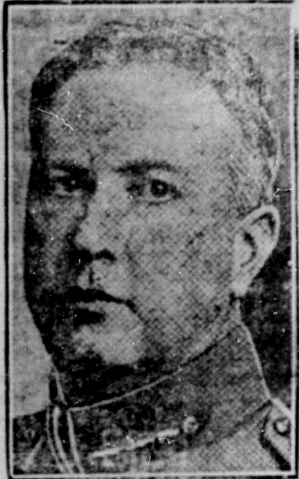
LT.-GEN. SIR ARTHUR CURRIE

Allied artillery has now full control of the converging roads in and out of Noyons near the southern end of the line, notably that running toward Ham to the north. The difficulty of the enemy in carrying out the retirement is thus markedly increased.