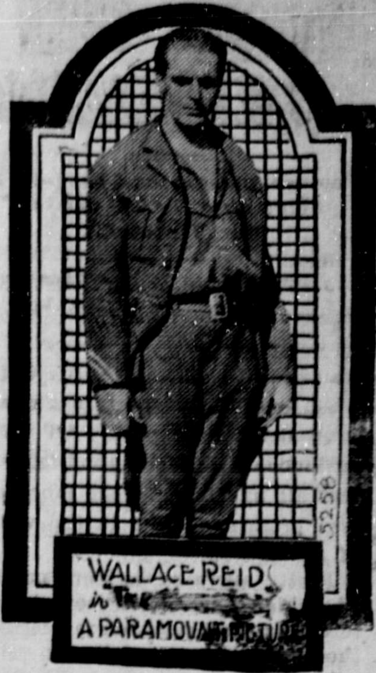
WALLACE REID A PARAMOUNT PRODUCTION

Queen Charlotte Islanders cannot do better than mail their printing needs to The News Print Shop and get the work done promptly and well.